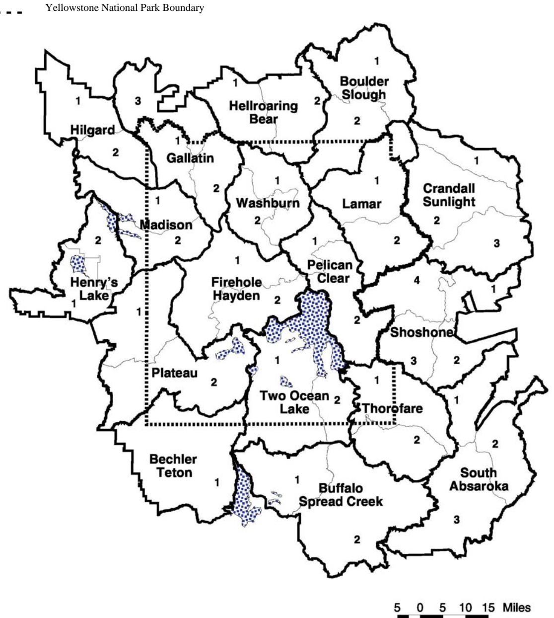
Figure 2. Yellowstone grizzly bear recovery zone boundary showing bear management unit (BMU) and subunit boundaries for application of Demographic Criterion 2.