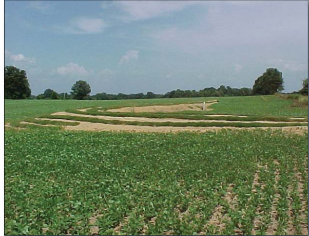
Figures 2 and 3. Examples of water and sediment control basins implemented in western Tennessee.

are the total macroinvertebrate families (or genera); the number of families (or genera) of mayflies, stoneflies, and caddisflies (collectively referred to as EPT—short for the order names Ephemeroptera, Plecoptera and Trichoptera); and the number of pollution-intolerant families (or genera) found in a stream. The biorecon index is scored on a scale from 1 to 15. A score of less than 5 is regarded as very poor. A score of more than 10 is considered good. The 2005 biorecon survey score for DeMoss Creek was 11. The survey documented four EPT families, one intolerant family and 18 total families—yielding an overall habitat score of 93. Those results indicate that the water quality in DeMoss Creek has improved and now supports the creek's fish and aquatic life designated use. Therefore, TDEC removed a 24.2-mile segment of DeMoss Creek from the state's CWA section 303(d) list of impaired waters in 2008.