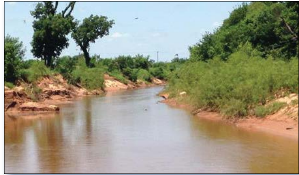
Figure 3. The OCC Rotating Basin Monitoring Program documented improved water quality in Commission Creek, seen here in 2015.

The OCC's statewide NPS ambient monitoring program documented improved water quality in Walnut Creek due to conservation efforts (Figures 2 and 3). The installed grazingland and nutrient management CPs worked to decrease erosion and reduce bacteria loading. CPs designed to improve pasture and rangeland resulted in denser vegetation and fewer bare spots, which reduced runoff of soil, nutrients and bacteria from animal wastes into waterbodies. In the 2014 assessment, monitoring data showed that the geometric mean of E. coli had decreased to 46 CFU, which is significantly below the state standard of