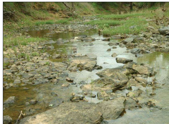
Figure 1. Lagoon Creek flows through Creek County in north central Oklahoma.

Landowners implemented BMPs with assistance from Oklahoma's locally led cost-share program and through the local Natural Resources Conservation Service (NRCS) Environmental Quality Incentives Program, Wildlife Habitat Incentive Program and general technical assistance program. These projects focused on keeping livestock away from the stream, protecting riparian areas and improving grazing