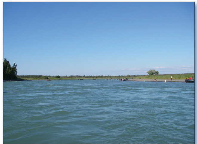
Figure 1. The scenic Lower Kenai River offers excellent fishing and recreation opportunities.

Stakeholders raised concerns of TAH pollution from in-river motorized boats based on the Kenai Watershed Forum (KWF)'s data collection from 2000 through 2003. In response, DEC conducted an assessment in 2003 that confirmed the presence of TAH, which are composed of benzene, toluene, ethylbenzene and xylene—all compounds in gasoline. Both KWF and DEC monitoring data show that during July of every year in areas of heavy boat use, the TAH levels exceed 10 micrograms per liter ( \mu\text{g/L} ), Alaska's water quality standard established for freshwater fish and aquatic life (see Figure 2). As a result, DEC added a 19-mile segment of the lower Kenai River to the state's 2006 CWA section 303(d) list of impaired waters for petroleum hydrocarbons, oils and grease. DEC believes the primary source