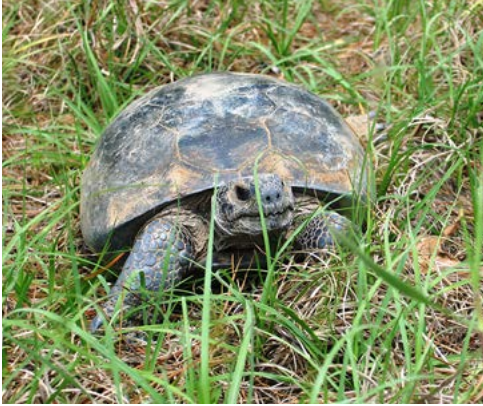
The gopher tortoise is the only native tortoise found east of the Mississippi River.