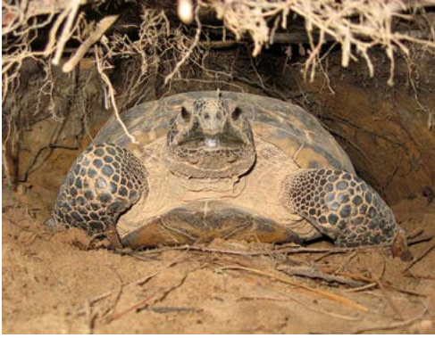
The gopher tortoise is a listed species under the Endangered Species Act in its western range, and a candidate for listing in its eastern range.