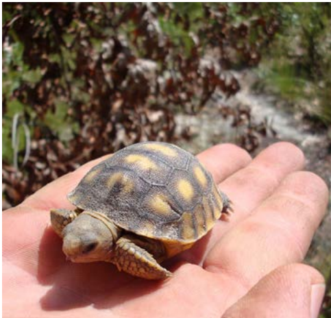
Female gopher tortoises lay about four to 10 eggs per clutch, and incubation lasts 85 to 100 days. This juvenile was found on state land in south Georgia during a survey in 2012.

A wide variety of information is available on the number and density of gopher tortoises and their burrows throughout their range. These data are the result of numerous surveys using a variety of methods ranging from one-time population counts to repeated surveys over several decades. The diversity of data poses a challenge when trying to evaluate the status of a species from a range-wide perspective. For example, in geographic areas where there is more data, the Service has higher confidence in drawing conclusions about the status of the population. In other areas, where there is little or no data, the Service's confidence in assessing the status of tortoises is lower.