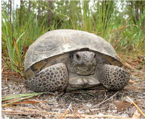
The forelimbs of the gopher tortoise are shovel-like, with claws used for digging burrows.