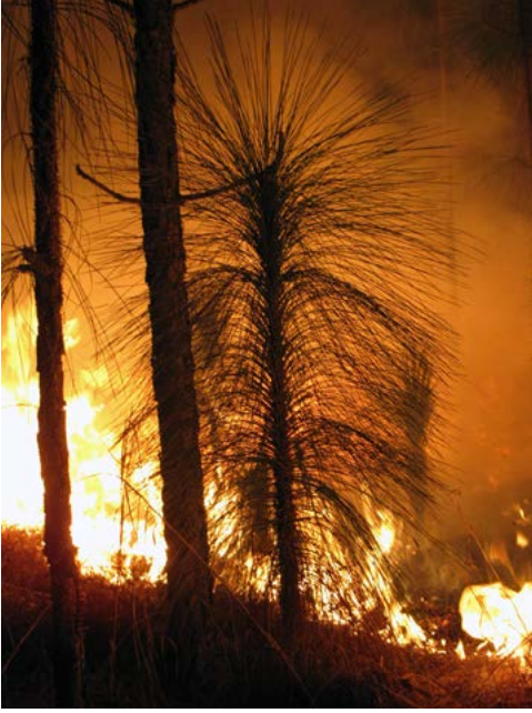
Fire is an integral part of the longleaf ecosystem.