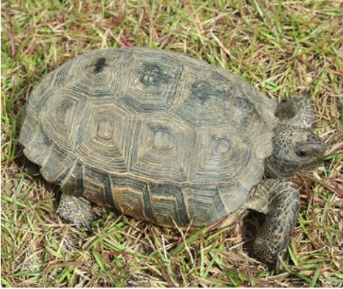
An adult gopher tortoise typically weighs between nine and thirteen pounds.