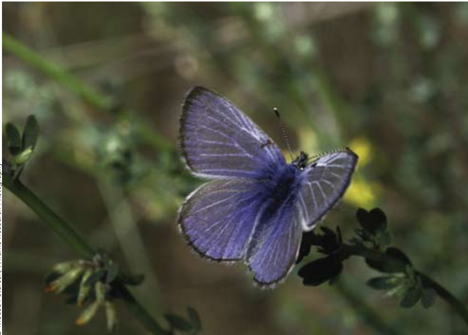
The Palos Verde blue butterfly of southern California benefits from captive-rearing facilities set up to recover this endangered species.