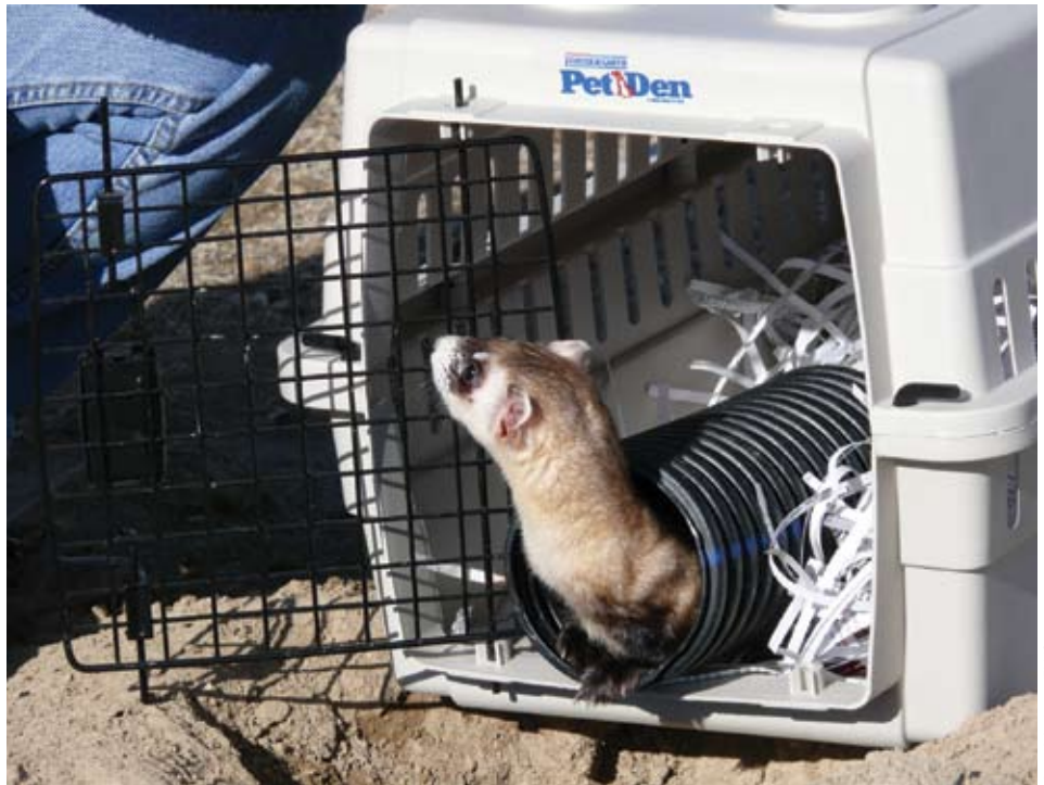
An endangered black-footed ferret gains its freedom at a reintroduction site in Kansas.

The “number of actions implemented” replaces the “recovery achieved” data that we have included in previous Recovery Reports to Congress. For recovery achieved, we reported a value of 1 to 4 that corresponded with a percentage of the species recovery objectives that had been achieved. However, this number did not necessarily correspond with the percentage of recovery actions implemented and we found that it was difficult to ensure that the measure was being applied consistently for all listed species. With the development and widespread use of the ROAR database, we now have an efficient means of tracking the actual number of recovery actions implemented. We believe that this value serves as a better indicator of the level of effort being invested to recover each listed species. We first began collecting these data in FY 2008 as we implemented reporting on the performance measures identified in the Endangered Species Program’s draft strategic plan.