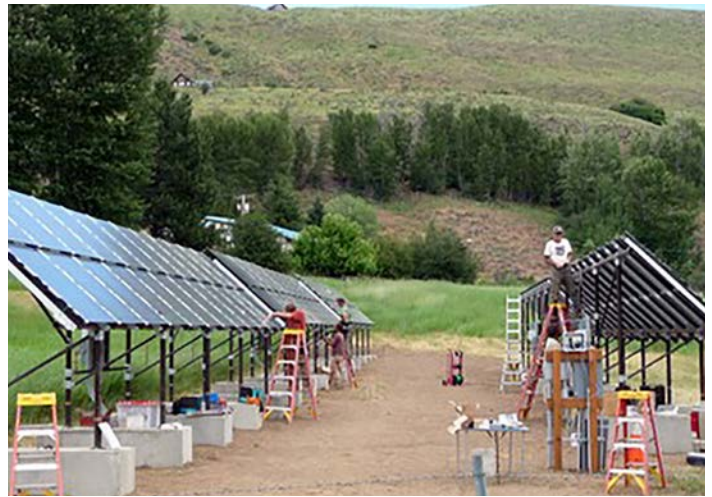
Winthrop Community Solar Project.

Preparing a No-Action Letter Request is a significant cost and time burden on project developers. Projects initiated by community groups, for example, may not have the resources to overcome this barrier. Work is underway, sponsored by the Department of Energy's SunShot Initiative, to bring clarity to the securities issue for shared solar projects at the federal level. However, the Securities Exchange Act of 1934 preserves much of the states' actions with regards to securities. 24 For this reason, state regulators will need to provide similar clarity at the state level.