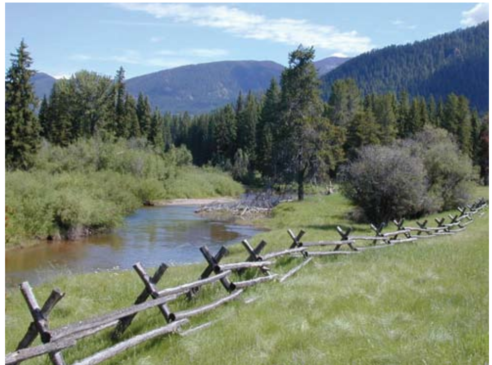
A view of Two Creeks Ranch, site of a Partners for Fish and Wildlife project to benefit bull trout and grizzly bears.