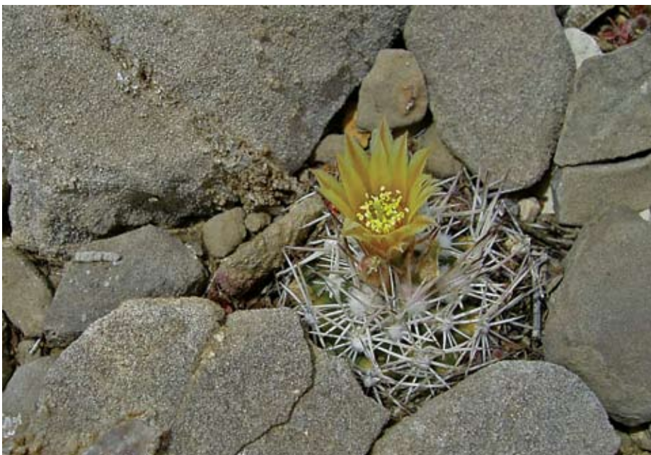
An FY 2005 Conservation Grant enabled scientists to study the Pima pineapple cactus.