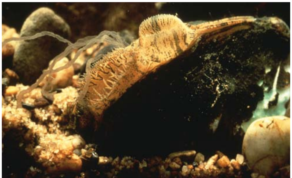
The Upper Tennessee River Basin provides habitat for a wide diversity of mussel and fish species.

Tom Vélaz, Dupage County Forest Preserve District