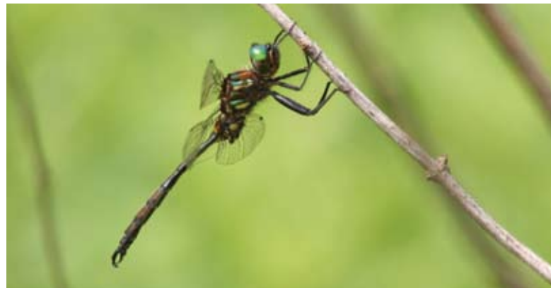
Hine's emerald dragonfly