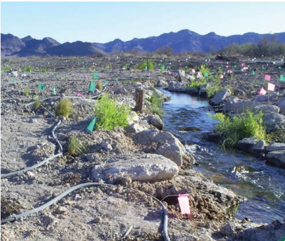
After a tamarisk-fueled wildfire burned the trees in 2005, the refuge recreated the stream outflow and planted native vegetation.

success at other islands within the refuge. The Hawaiian Islands NWR also provides essential habitat for many other endangered animals and plants.