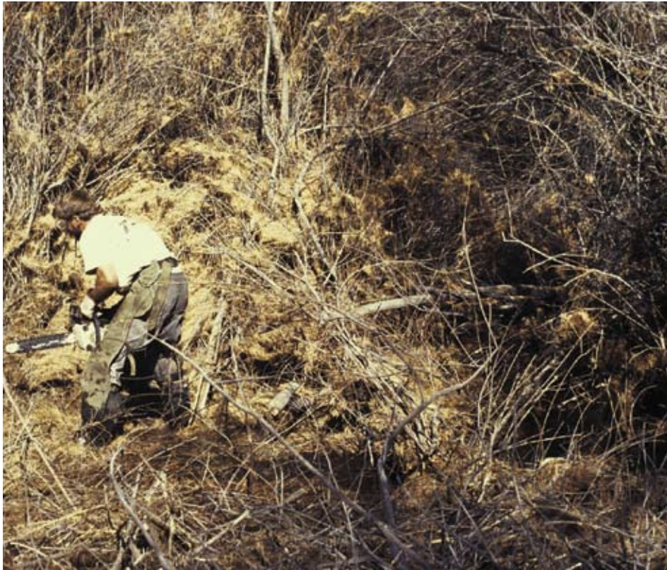
In 1998, the outflow of Jackrabbit Spring at Ash Meadows was choked with non-native tamarisk trees.