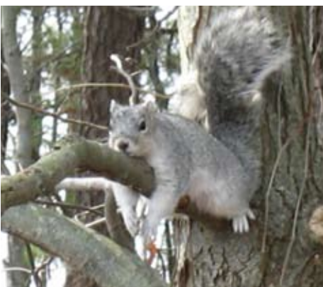
Delmarva fox squirrel

Plants also benefit from wetland protection. In the Pocomoke River watershed on the Delmarva Peninsula, the NWI mapped 730,000 acres to help plan for recovery of an endangered plant, the swamp pink, which is associated with the nation's northernmost bald cypress swamps and stands of Atlantic white cedar. The digital data also will help with recovery planning for another resident of this area, the endangered Delmarva fox squirrel.