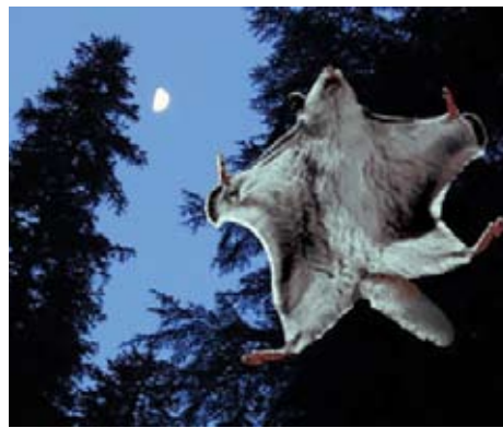
Olympic National Park

The species status information contained in this report reveal a substantial shift between the FY 2003-2004 and FY 2005-2006 reporting periods. Species reported as having uncertain status decreased from 42 percent to 23 percent. Concurrently, there were increases in species reported as stable, improving, and declining. Thus, this shift stems from a redistribution of species from unknown to known status between the two reporting periods. This change was brought