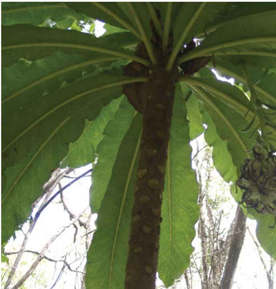
U.S. Army Guard Hawaii Environmental Staff (Same on facing page)