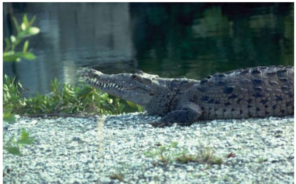
The Service proposed in 2005 to reclassify the Florida population of the American crocodile from endangered to the less critical status of threatened due to the reptile's improving status.

One species was delisted due to a taxonomic revision. The Arizona agave is no longer considered by most