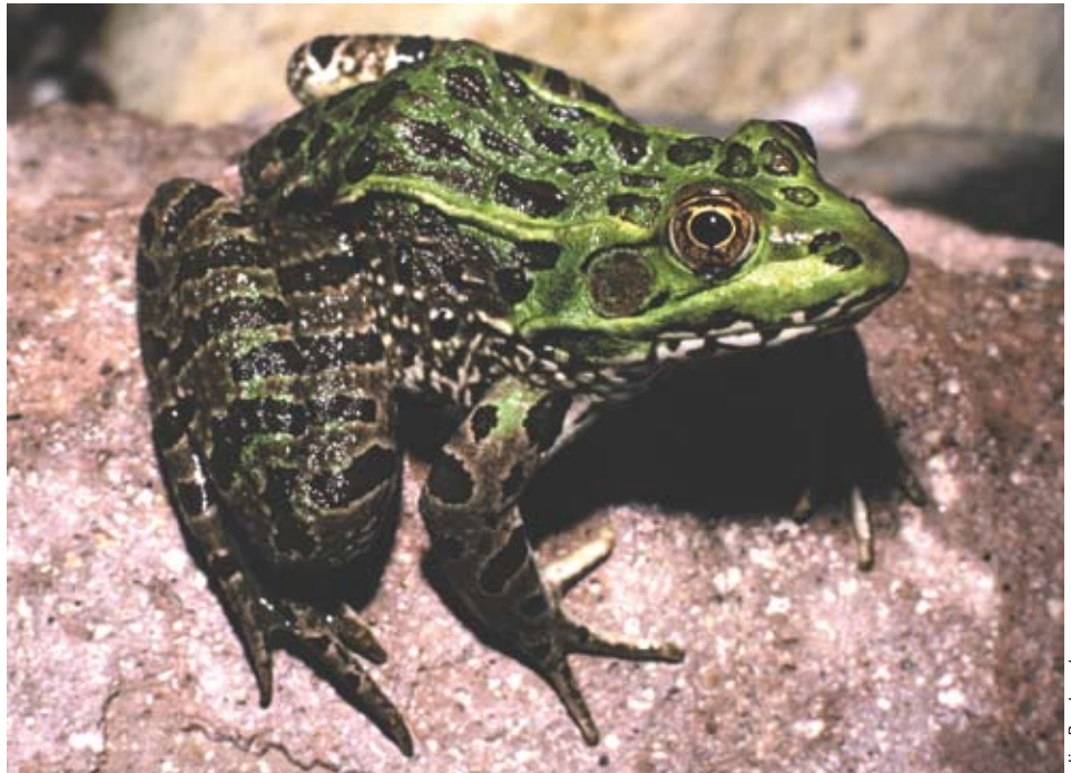
Chiricahua leopard frog

The Upper Tennessee River Basin in the Clinch, Powell, and Holston River drainages supports one of the most diverse freshwater mussel and fish communities in the nation, with over 85 species of mussels and 149 fish species, some found nowhere else. Twenty-six of these mussel and fish species are listed under the Act. The NWI mapped over 3.3 million acres across four states in this mountainous basin to identify habitat threats and high-priority areas for conservation and restoration. The Service is working with other federal and state resource agencies, soil and water conservation districts, and local watershed groups to put this information to use for species recovery.