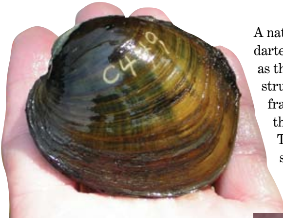
A Higgins eye pearlymussel engraved with a tracking number.

Although fish hatcheries play a critical role in the conservation and recovery of aquatic species, they support more than fish. Several federal hatcheries are also aiding in the recovery of imperiled amphibian and mussel species. For example, using state-of-the-art propagation techniques, the Genoa National Fish Hatchery in Wisconsin has produced and released an estimated 1.1 million endangered Higgins eye pearlymussels.