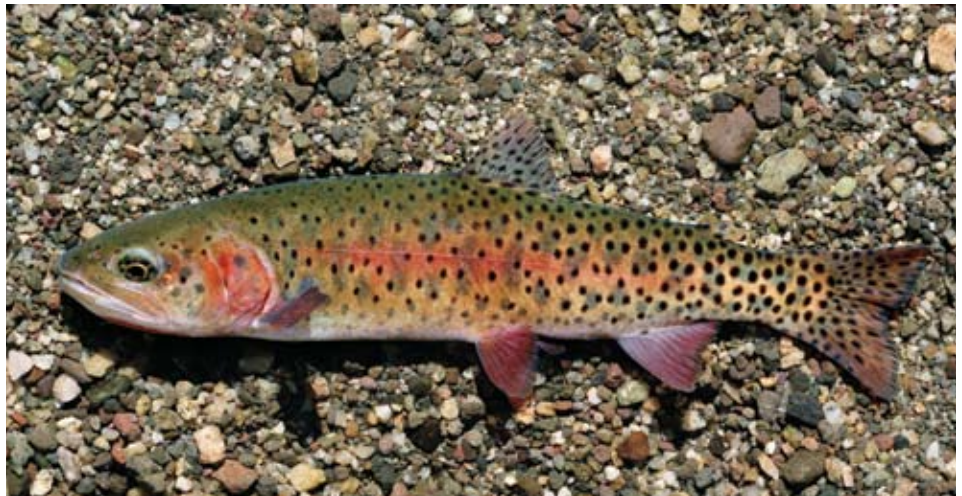
Lahontan cutthroat trout

The Lahontan National Fish Hatchery Complex in Nevada is part of a program that combines fishery management assistance, a hatchery, and a facility that allows migrating endangered fish to bypass a dam. The program conducts critical recovery activities for two listed fish species, one of which is the threatened Lahontan cutthroat trout, Nevada's state fish. This fish was of tremendous commercial and recreational importance until widespread water diversions, stream barriers, and introduced non-native fish reduced it to a small fraction of its former range. The hatchery complex is focusing on watershed connectivity and restoration, and on producing Lahontan cutthroat trout for reintroduction, research, and recreational fishing. It is rearing a unique strain of native Lahontan cutthroat trout for these recovery programs. At the same time, the Marble Bluff Fish Passage Facility at Pyramid Lake, operated by the Service's Nevada Fishery Resource Office, has moved record numbers of cui-ui, an endangered fish, above Marble Dam into their spawning habitat in the Truckee River. The cui-ui is of great cultural importance to the Pyramid Lake Paiute Tribe as well as to the ecology of the lake itself.