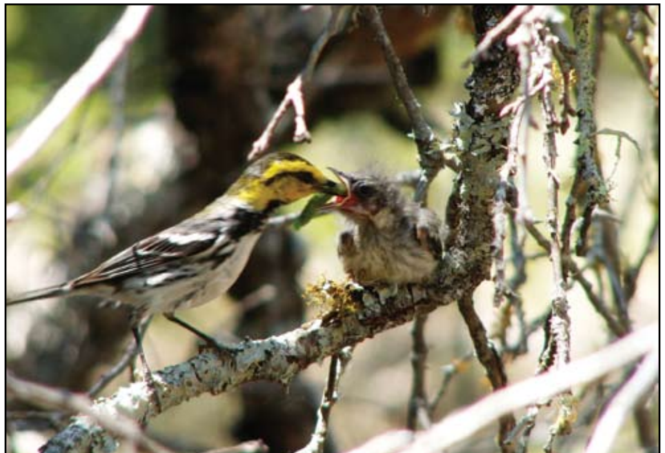
A golden-cheeked warbler feeds its young.

Just as the Act makes all federal agencies responsible for the conservation of listed species, all of the Service's programs share in that responsibility. Some examples of the various Service activities benefiting listed species follow.