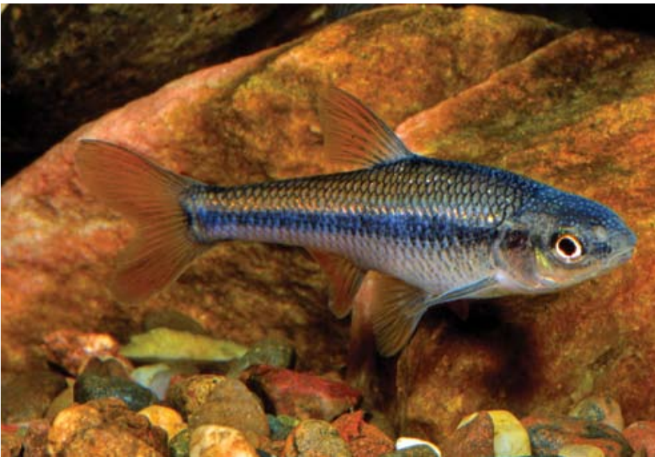
The Topeka shiner benefits from a Partners for Fish and Wildlife project in Iowa.

In 2004 and 2005, Partners staff at the Service’s Rock Island (Illinois) Field Office worked with the Iowa Natural Heritage Foundation and two private landowners on a habitat restoration project for the Topeka shiner along Cedar Creek in Greene County, Iowa. The project restored the hydrology of an oxbow in the Cedar Creek floodplain and provided permanent off-stream refugia and potential spawning habitat for Topeka shiners. It also reconnected the downstream end of the oxbow to Cedar Creek to allow Topeka shiners to disperse into the watershed.