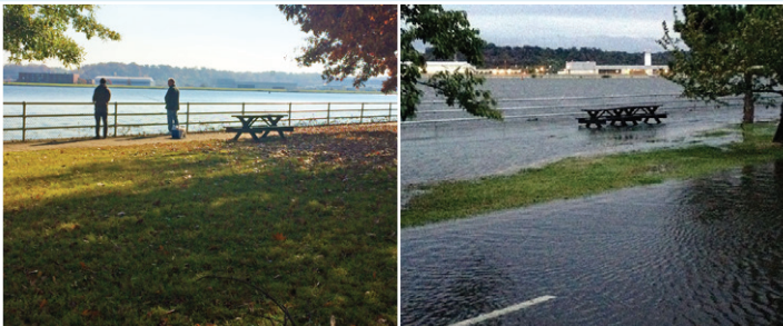
Fishing at Hains Point in East Potomac Park (left) and flooding in the same area in September 2015 (right). Hains Point is one of several areas along the Potomac that could be regularly inundated at high tide as sea level rises.

Although few homes in the District are close enough to sea level to be permanently submerged, sea level rise can exacerbate damage caused by storm surges and river flooding. A higher average water level in the Potomac and Anacostia provides a higher base for storm surges and river surges, which means that water pushed inland by storm winds could penetrate farther into adjacent dry land, as could flood waters from upstream. A higher water level also makes storm drains less effective.