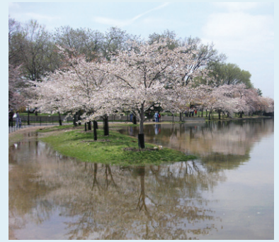
Flooding at the Tidal Basin during cherry blossom season. As the climate changes, tidal flooding is occurring more often, while Washington's famous cherry trees are blooming earlier in the spring.

portions of the Anacostia River, where surveys have found nearly 200 bird species; marshes on Roosevelt Island; and other marshes downstream along the Potomac. The rise in sea level may also submerge parts of the swamp forest on Roosevelt Island.