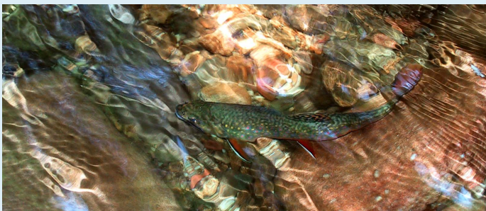
A native brook trout camouflaged against the rocky bottom of a cold West Virginia stream.

Recreation and related tourism in West Virginia are closely tied to the weather. Many people enjoy whitewater rafting on West Virginia's rivers every year, including more than 60,000 on the Gauley River alone. The use of these rivers depends on the flow of water being sufficient for the thrilling rides that people seek. Native populations of brook trout, the official state fish, depend on West Virginia's mountain streams remaining cold. But suitable habitats for brook trout and other coldwater fish are likely to shrink as some streams become too warm to support them.