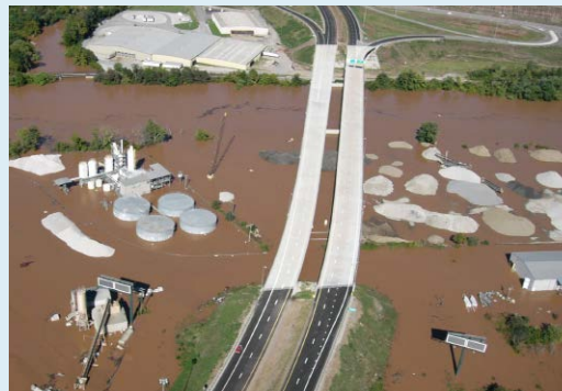
Floodwaters from the Little Kanawha River in Parkersburg.

Flooding occasionally threatens riverfront communities, and heavier storms and greater river flows could increase this threat. The U.S. Army Corps of Engineers operates dozens of dams and reservoirs to help prevent serious floods in West Virginia. Nevertheless, dams and other flood control structures cannot prevent all floods. In recent decades, the state has had flood-related disaster declarations nearly every year. These disasters have often been associated with heavy rainstorms that also caused landslides and mudslides.