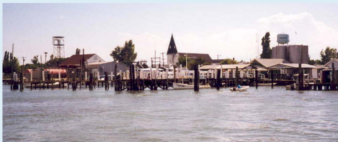
The rising sea threatens low-lying coastal towns such as Tangier, which is less than five feet above sea level.

Increased rainfall could further exacerbate flooding in both coastal and inland areas. The amount of precipitation during very heavy storms increased by 27 percent between 1958 and 2012 in the Southeast, and the trend toward increasingly severe rainstorms is likely to continue.