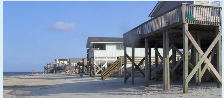
Oceanfront houses in Virginia Beach are vulnerable to severe storms, flooding, and coastal erosion.

Sea level is rising more rapidly along Virginia's shores than in most coastal areas because the land is sinking. If the oceans and atmosphere continue to warm, sea level along the Virginia coast is likely to rise sixteen inches to four feet in the next century.