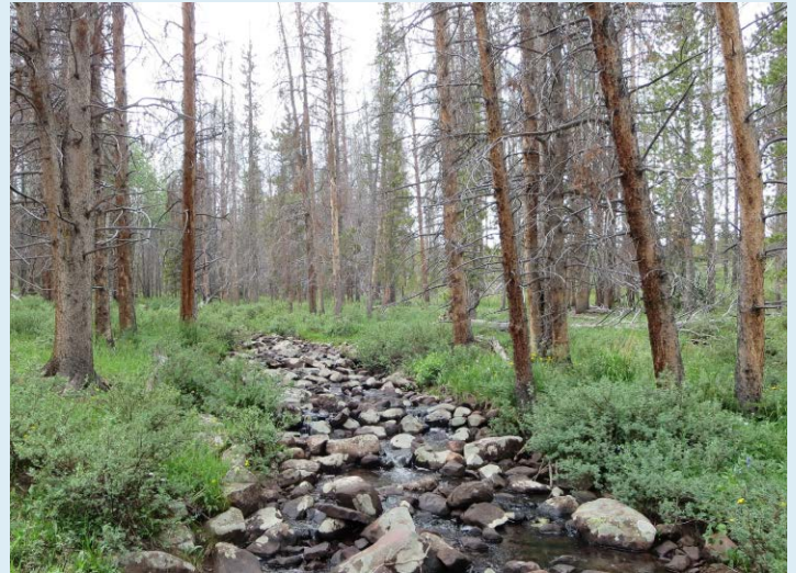
In Utah's Uinta-Wasatch-Cache National Forest, bark beetles have killed more than 90 percent of the trees in some areas.

Warmer and drier conditions make forests more susceptible to pests. Drought reduces the ability of trees to mount a defense against attacks from pests such as bark beetles, which infested 50,000 acres of Utah's forests in 2012. Temperature controls the life cycle and winter mortality rates of many pests. With higher winter temperatures, some pests can persist year-round, and new pests and diseases may become established.