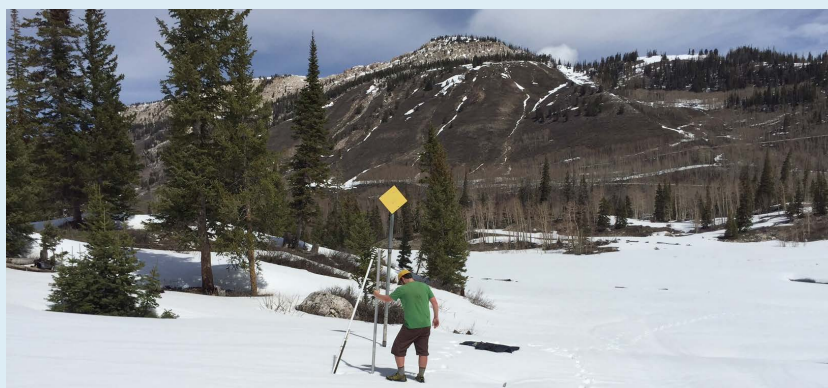
A surveyor measures the depth of the snowpack at Mt. Baldy on the Wasatch Plateau in April 2015. The map below shows the results of many years of this type of measurement.

Diminishing snowpack can shorten the season for skiing and other forms of winter tourism and recreation. The tree line may shift, as subalpine fir and other high-altitude trees become able to grow at higher elevations. A higher tree line would decrease the extent of alpine tundra ecosystems, which could threaten some species.