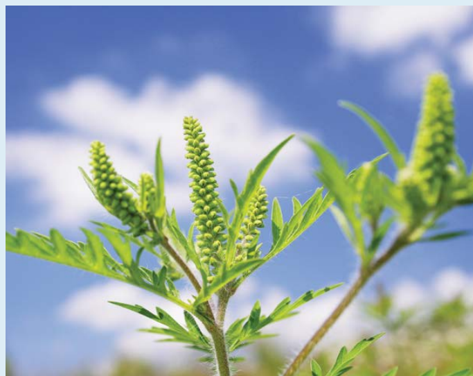
A photo of a ragweed plant, a common source of allergens in North Dakota. Like many crops and pollen sources, ragweed will have a longer growing season as temperatures rise. Stock photo.

Climate change may also increase the length and severity of the pollen season for allergy sufferers. For example, the ragweed season in Fargo has grown 19 days longer since 1995, because the first frost in fall is later.