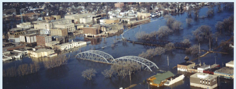
Flooding of the Red River at Grand Forks in 1997. Flood magnitudes have been increasing since the 1920s in the Red River watershed.

Greater river flows, increasing precipitation, and more severe storms are each likely to increase the risk of flooding. The year 2011 was one of the wettest years on record: the Souris River near Minot crested at four feet above its previous record, with a flow five times greater than any in the past 30 years, and flooding occurred throughout the state. In the Red River watershed, river flows during the worst flood of the year have been increasing about 10 percent per decade since the 1920s.