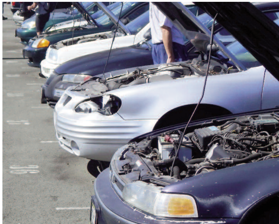
Patrons inspect vehicles for potential bidding.