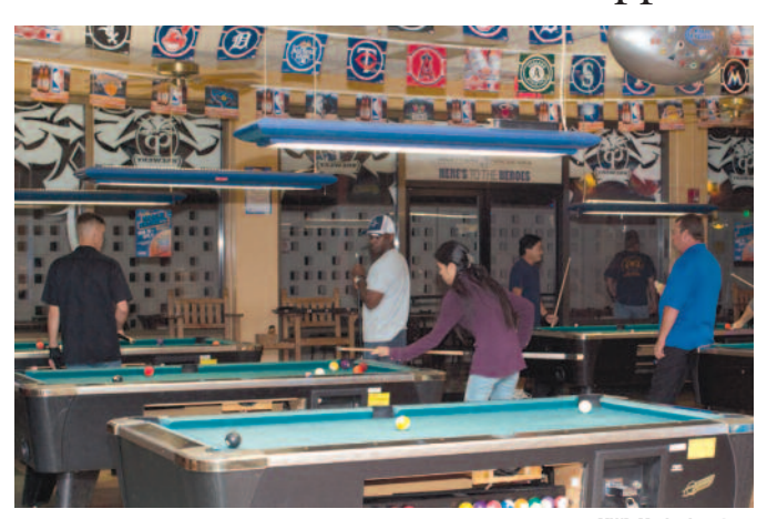
Patrons can relax over a game of pool during chill 'n' grill at Brews &

J.R. Rockers recently announced that their twicemonthly TGIF is now open to everyone. Previously only for club members and their guests, down, grab a bite to eat, and maybe even win a prize. A bufyou are a club member. Pupus free mini pool tournament is an Sam Choy's at 422-3002.