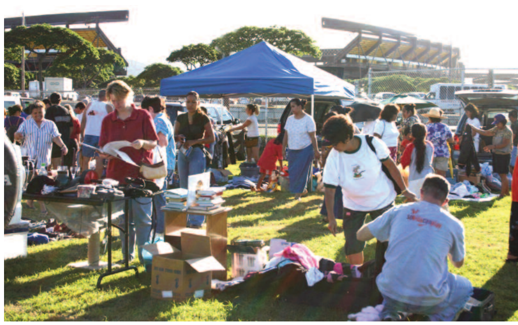
Shoppers browse among the stalls at a previous Super Garage Sale.

Catlin SAC can serve 230 children every day and is open to all military and civilians working on Department of Defense bases on Oahu. The facility is currently at half capacity and accepting new applicants. Beforeand after school care is available when public schools are open and activity-based camps and hourly care are available when public schools are The activities are set up so kids can not in session. For more information have fun, learn and develop skills at about Catlin SAC, call 421-1556 or the same time. Catlin SAC also visit www.greatlifehawaii.com.