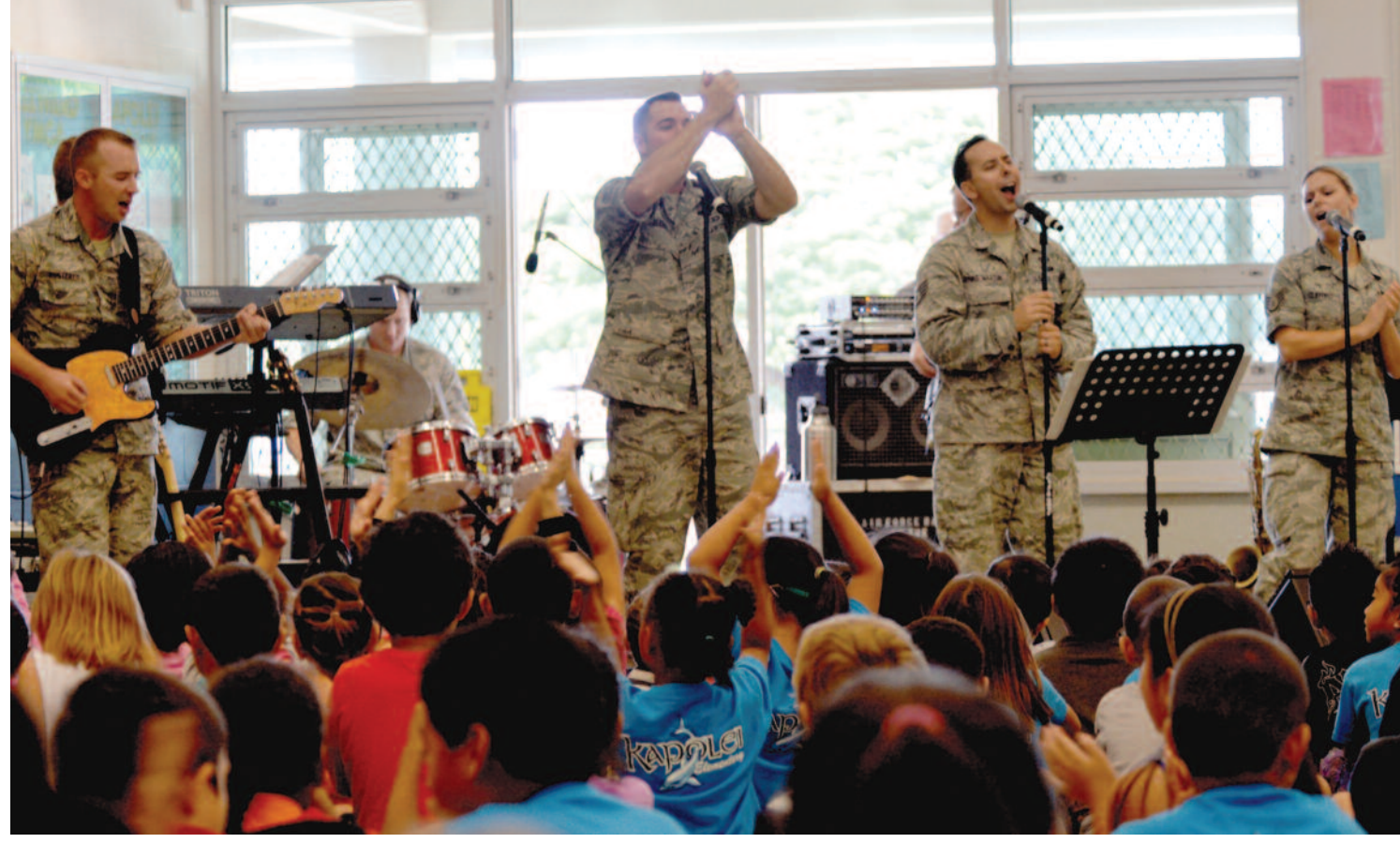
"The students were very polite, Members of Hana Hou!, the rock band of the U.S. Air Force Band of the Pacific-Hawaii, perform a song for Kapolei Elementary School students and faculty members in Kapolei Nov. 5.