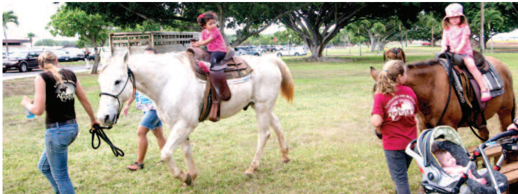
MWR Marketing photo

Pony rides are among the activities available for children Saturday at the Fall Craft Fair and Family Fun Day.