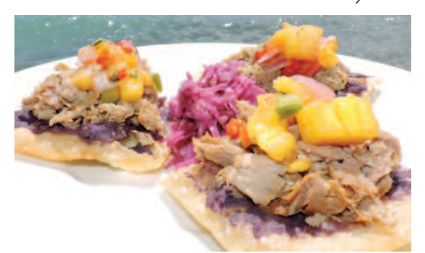
The kalua pork tostada is a new appetizer on Sam Choy's

etable sandwich is a com- delicious, but beautiful." bination of portobello bell peppers, topped with alfalfa sprouts and ripened tomato. A variety One of the new items on of appetizers, soups, salads, sandwiches and entrees complete the menu.