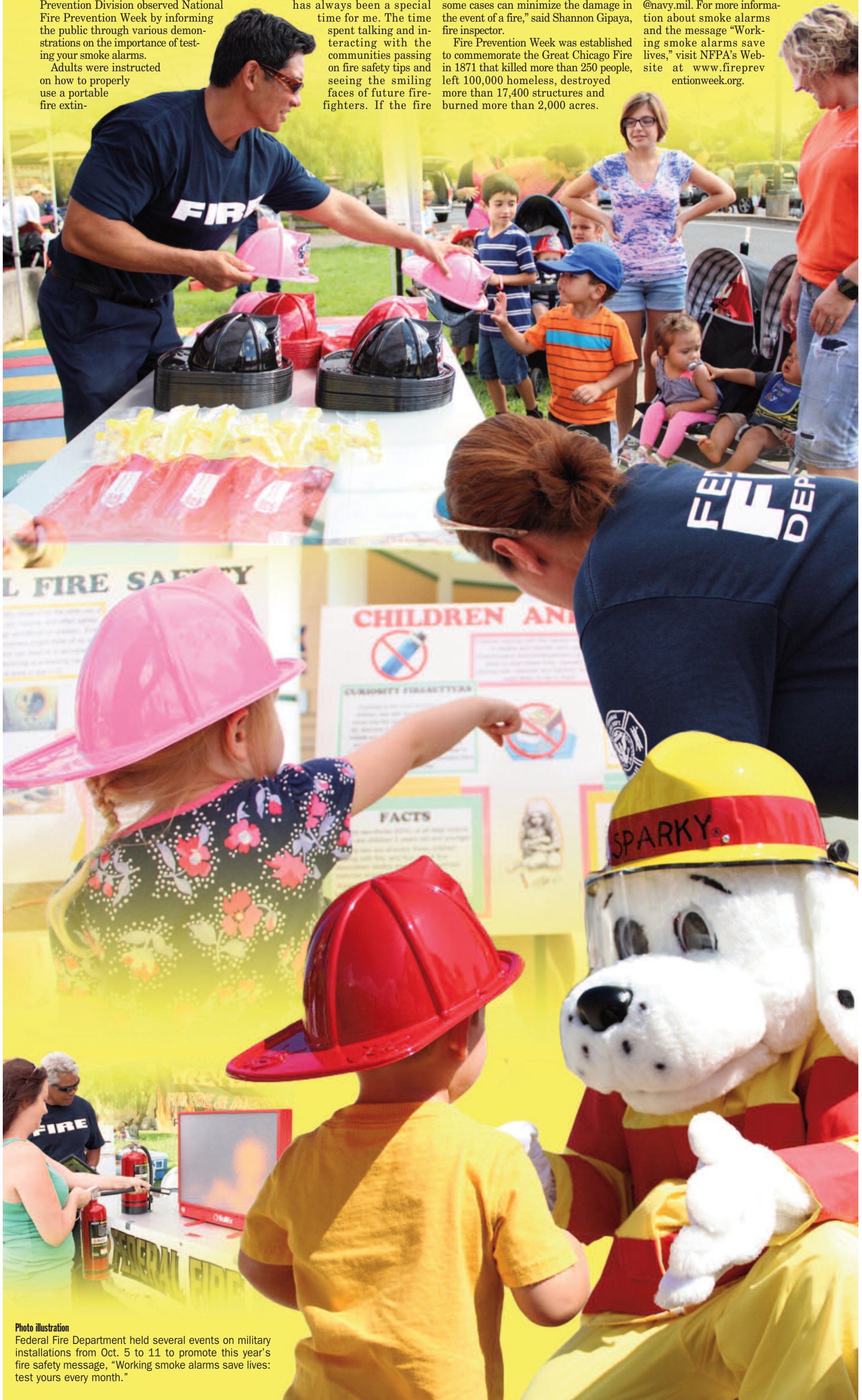
Photo illustration Federal Fire Department held several events on military installations from Oct. 5 to 11 to promote this year's fire safety message, "Working smoke alarms save lives: test yours every month."