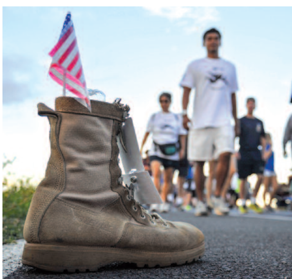
(Above) A lone boot of a fallen service member serves as somber reminder of sacrifice to participants of the 2014 Tripler Fisher House 8K Hero & Remembrance Run, Walk or Roll.

The Tripler Fisher House is located behind the Tripler Army Medical Center. A Fisher House is "a home away from home" for veterans and military families of patients receiving treatment at military medical centers.