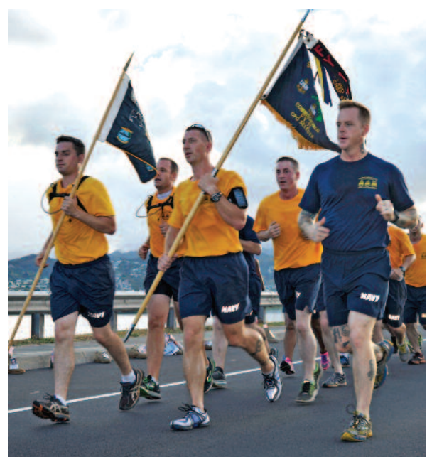
(Above) Chief petty officers run in formation during the 2014 Tripler Fisher House 8K Hero & Remembrance Run, Walk or Roll.