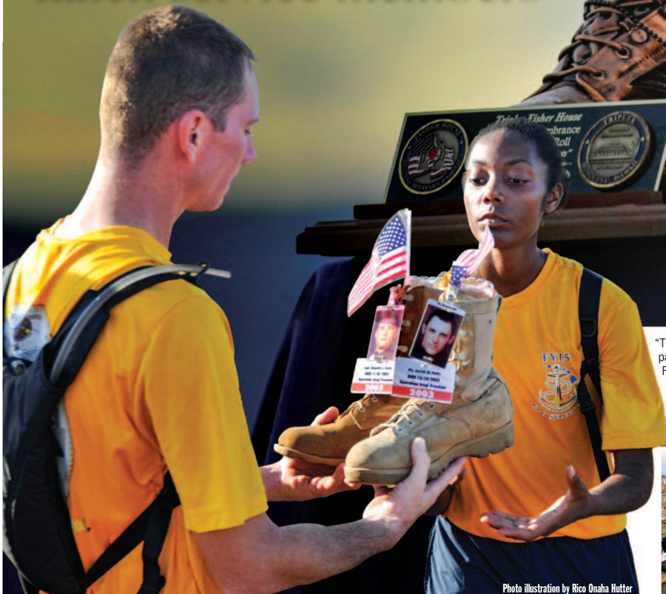
"Traveling Bronze Boots," awarded to the unit with the most participation, stand on the podium during the 2014 Tripler Fisher House 8K Hero & Remembrance Run, Walk or Roll on Ford Island.