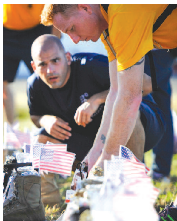
(Right) Chief petty officer (CPO) selectees line up the boots of fallen service members.