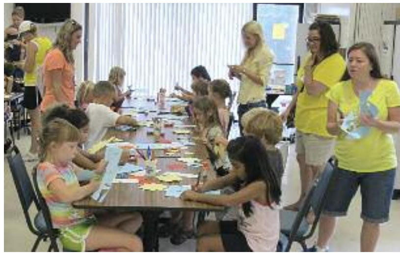
Children participate in craft activities at Hickam Chapel, Joint Base Pearl Harbor-Hickam, during Vacation Bible School.

"It's been great," he said. "We've been able to really consolidate our volunteer resources and reach more children."