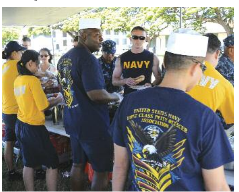
Sailors assigned to Naval Operational Support Center (NOSC) serve service members and their family members during the NOSC family day picnic.