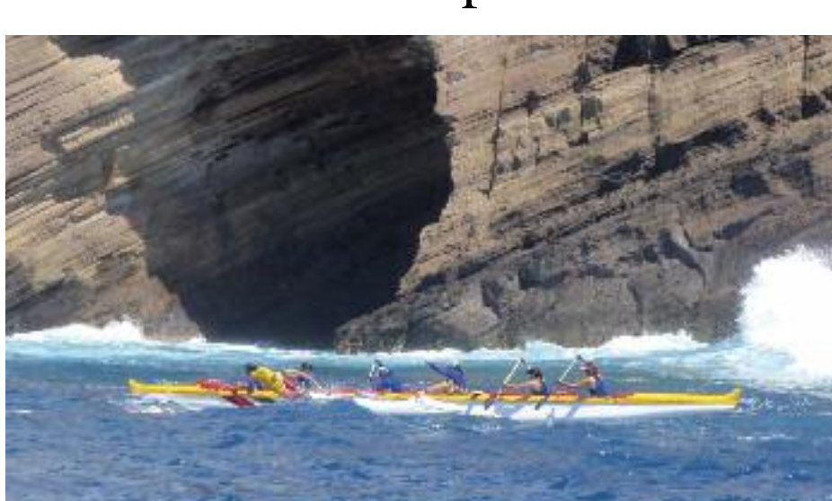
Members of the Honolulu Pearl Canoe Club paddle past Oahu's rugged south shore cliffs.

show up during practice times and mention that