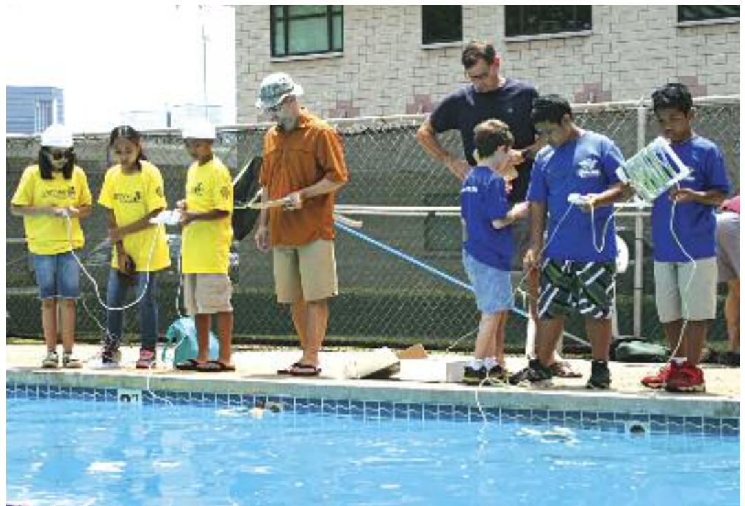
Teams from elementary and middle schools navigate their underwater remotely operated vehicles (ROV) through an obstacle course held May 3 during the SeaPerch robotics competition at the U.S. Coast Guard base at Sand Island. The competition was hosted by the U.S. Coast Guard and co-sponsored by the Pearl Harbor Naval Shipyard, SPAWAR, Hawaii Department of Education and AFCEA.