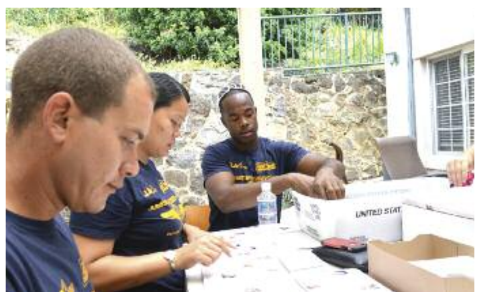
Volunteers recently assist the Ronald McDonald Charities of Hawaii by stuffing envelopes.