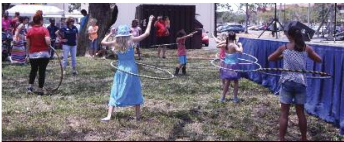
Keiki competitions were a part of the craft fair festivities on May 3.