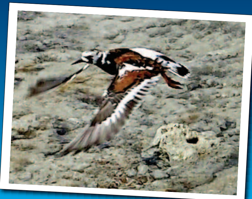
How to submit: send your (nonposed) photos to editor@hookelenews.com .