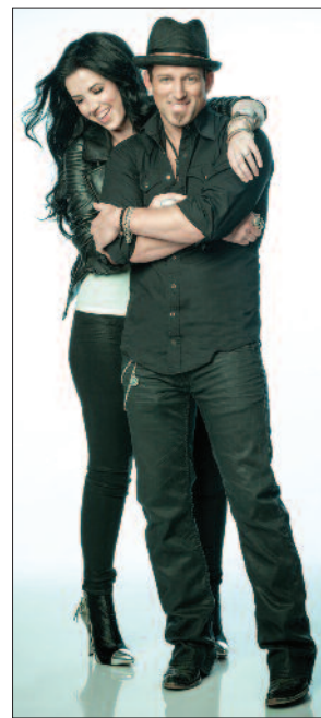
Vocal duo Thompson Square will perform Sunday at Ward Field.

Since their debut in 2010, the husband and wife duo of Keifer and Shawna Thompson has been one of the hottest country music acts. Their string of chart toppers include "Are You Gonna Kiss Me or Not," "I Got You," "Glass" and their most recent No. 1 hit "Everything I Shouldn't Be Thinking About."