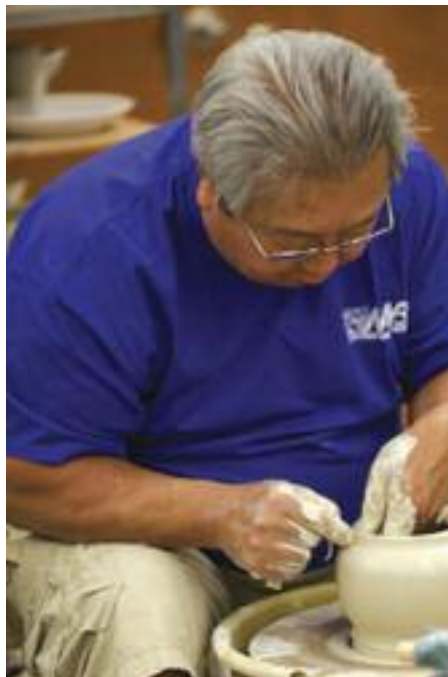
Demonstrations will be provided at the Hickam Arts & Crafts Center's open house Saturday.