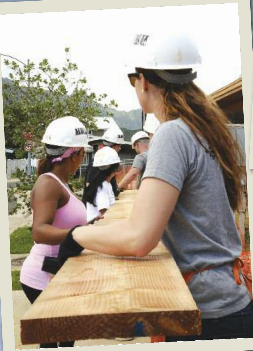
Hickam Airmen and local volunteers assist with sawing during Honolulu Habitat for Humanity volunteer day.