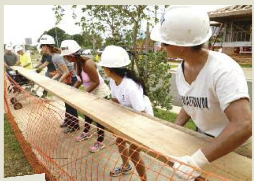
Hickam Airmen and local volunteers tackle sawing wood during the home-building event.