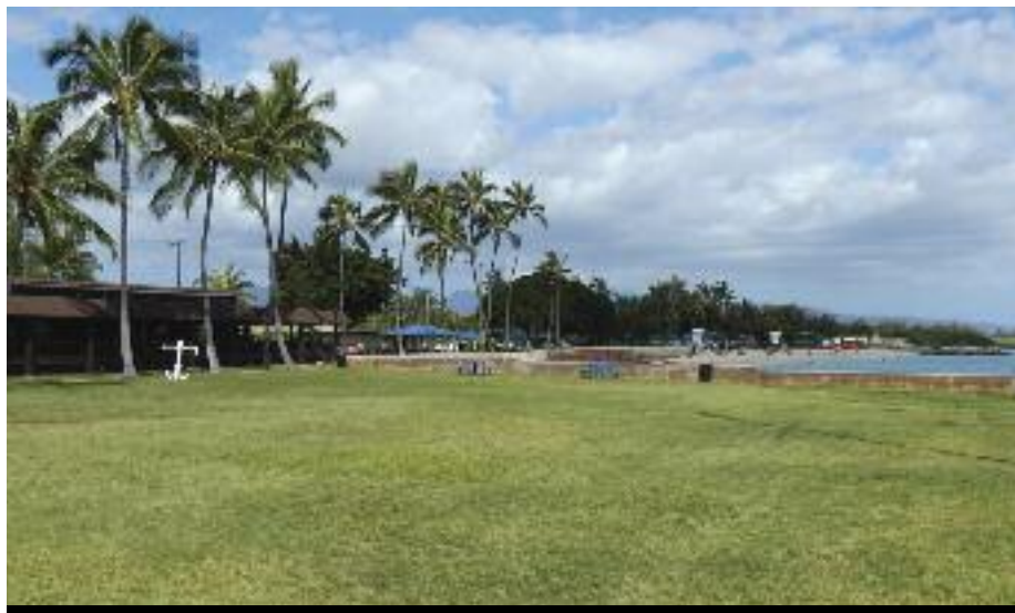
The waterfront lawn at Hickam Harbor is the location for tonight's movie.