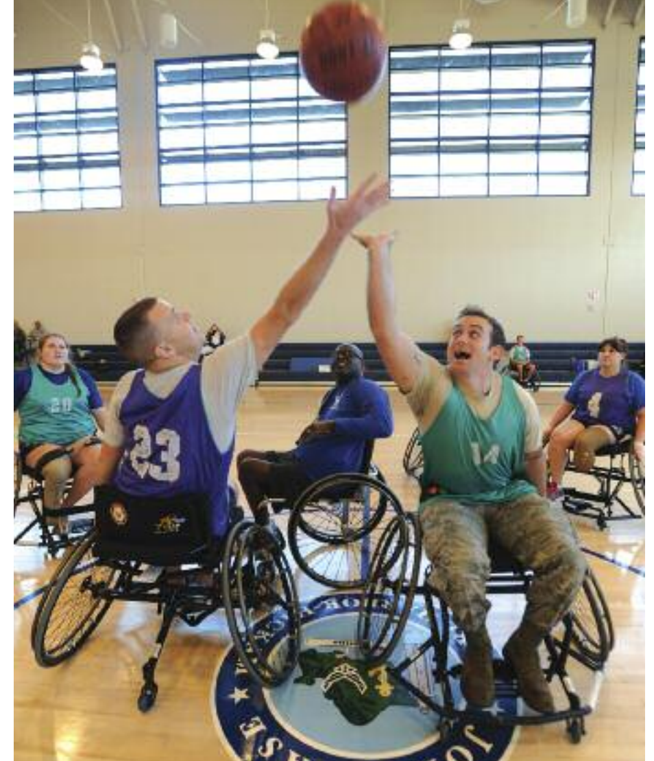
Wheelchair basketball players reach for the ball.