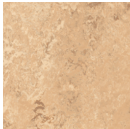
Vibrant colors with texture