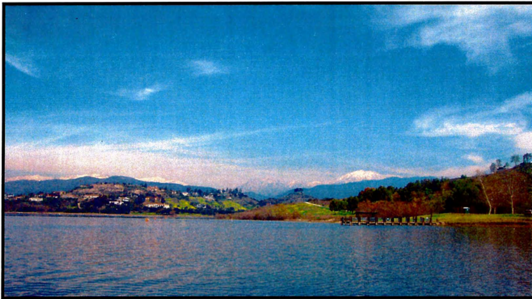
Photo: Puddingstone Reservoir