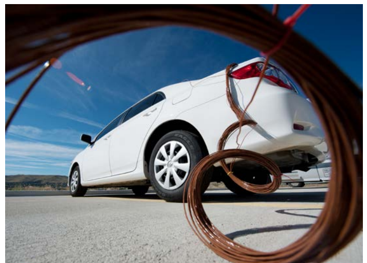
Car undergoing climate control analysis at the VTIF.

smoothing the transition and reducing costs for EV owners. NREL's collaboration with automakers, charging station manufacturers, utilities, and fleet operators to assess technologies using VTIF resources is designed to enable PEV communication with the smart grid and create opportunities for vehicles to play an active role in building and grid management. Ultimately, this creates value for the vehicle owner and will help renewables be deployed faster and more economically, making the U.S. transportation sector more flexible and sustainable.