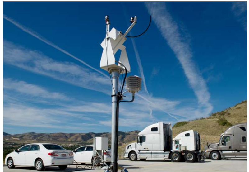
Weather station and vehicles on the VTIF test pad. Photo by Dennis Schroeder, NREL 19930