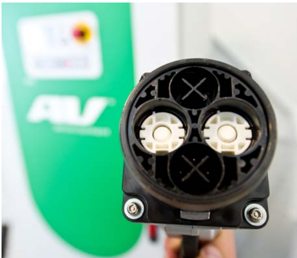
Automotive fast charger enabling 60 miles of range from 20 minutes of charging.