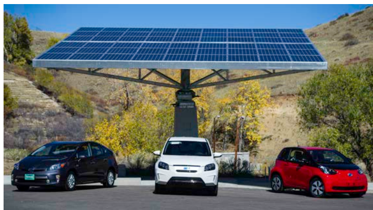
Electric vehicles parked under the solar tree charging system.