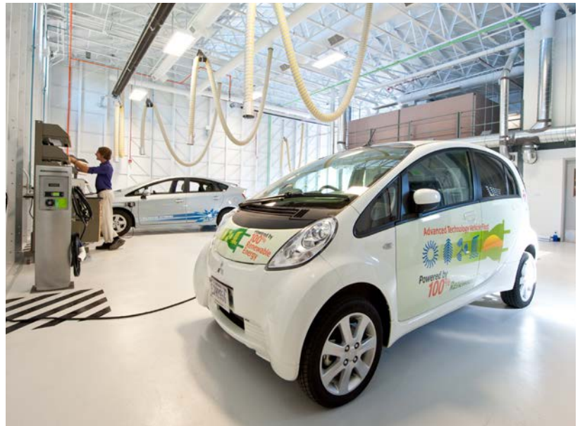
PEV charging in the VTIF.