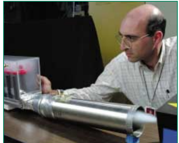
Warren Gretz, NREL/PIX 04468