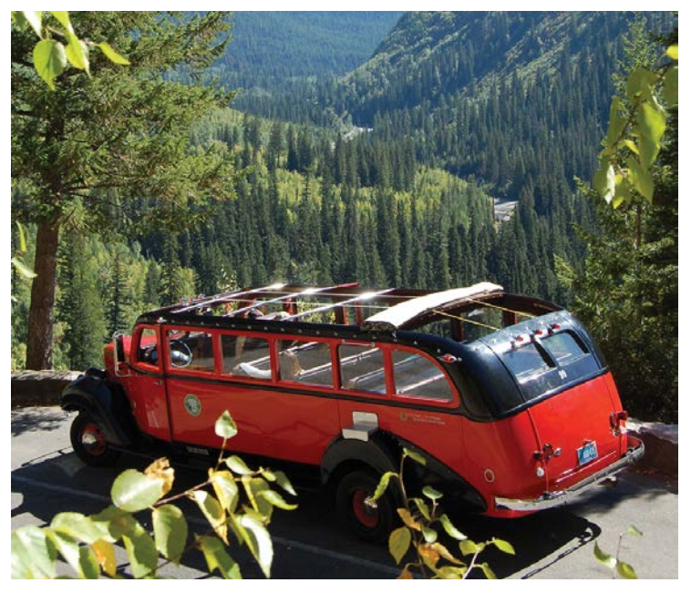
NREL provides guidance and resources for private companies and government agencies looking to green their fleets. Top photo by Dennis Schroeder, NREL 26520; bottom photo courtesy of Glacier Park, Inc., NREL 27574-C