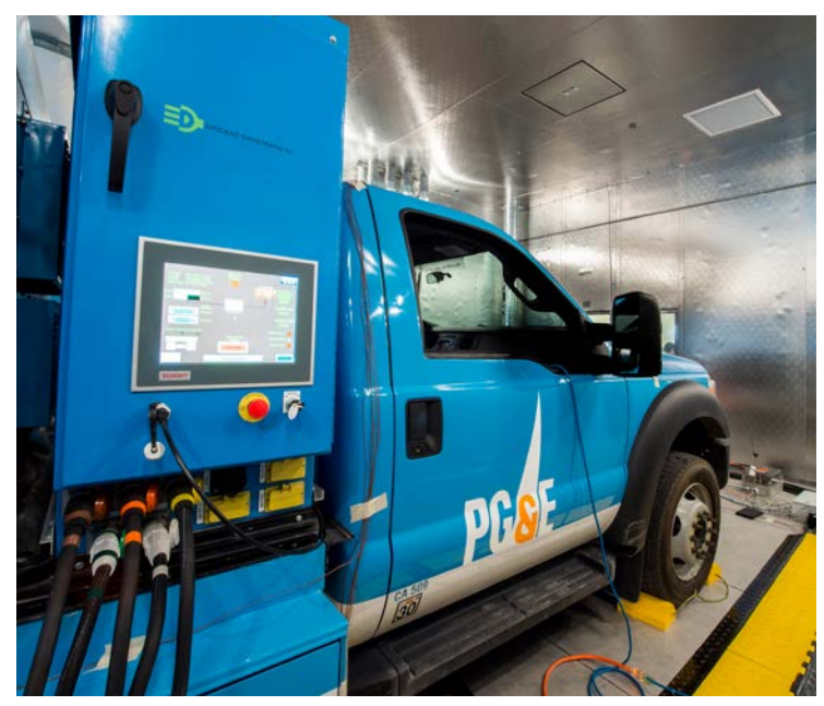
Research is conducted both on the road and in the laboratory, supporting deployment of a wide range of vehicle technologies.