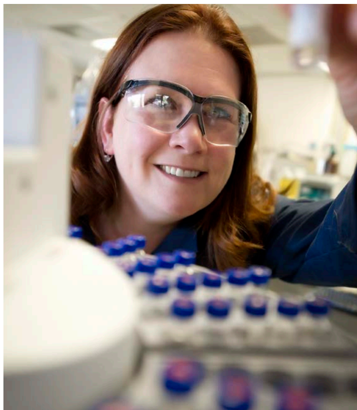
NREL researchers assess fuels over a range of conditions to optimize potential for real-world application.

Impact: The new 11.9-liter NG engine, combined with the surge in U.S. NG discoveries, make this a competitive option for commercial vehicles, including the trucks that transport 18.3 billion tons of freight each year.