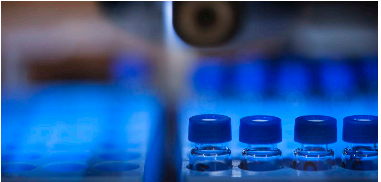
NREL researchers develop and characterize a wide range of renewable and advanced petroleum-based fuels.