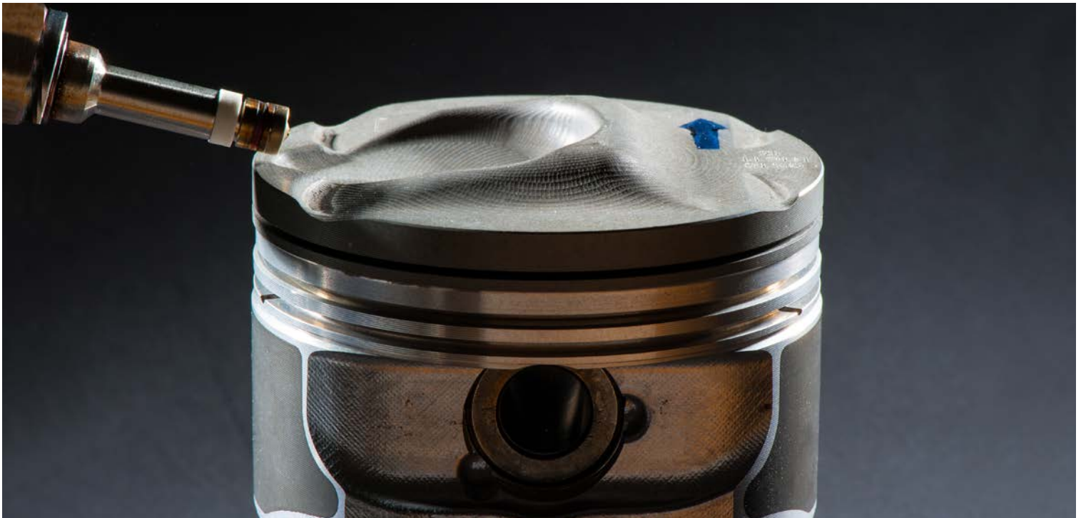
NREL studies effects of new fuel properties on performance and emissions in advanced engine technologies.