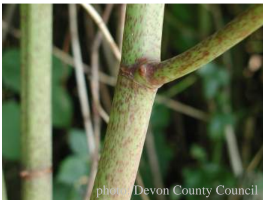
Close-up of stem