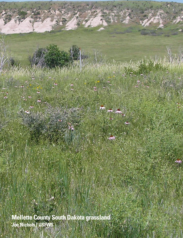
Mellette County South Dakota grassland