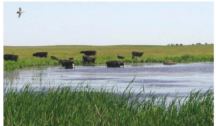
Wetland with cattle