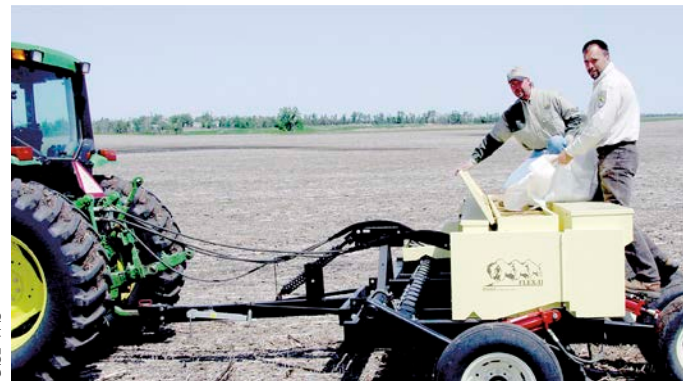
Pheasants Forever and Service biologists loading a grass drill

“I want to thank you for putting this seeding project together and making it workable for us. What a great thing to do for our land, our wildlife, and our operation.”