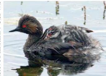
Eared grebe with chick