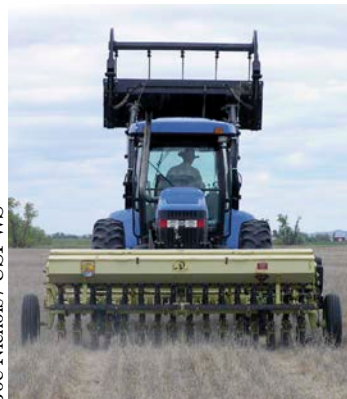
Planting native grass

Often times, native forbs are added to the plantings as well which also enhance grazing opportunities and add nitrogen to the soil.