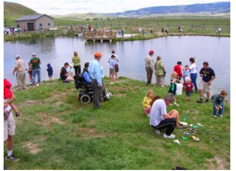
Kid's Fishing Day is held each June.

Join the hatchery staff each June as they kick off National Fishing and Boating Week with a free Kid's Fishing Day. The event, for children under the age of 14, is fun and educational. Food, poles, prizes and much more are included in the festivities. You won't want to miss it!