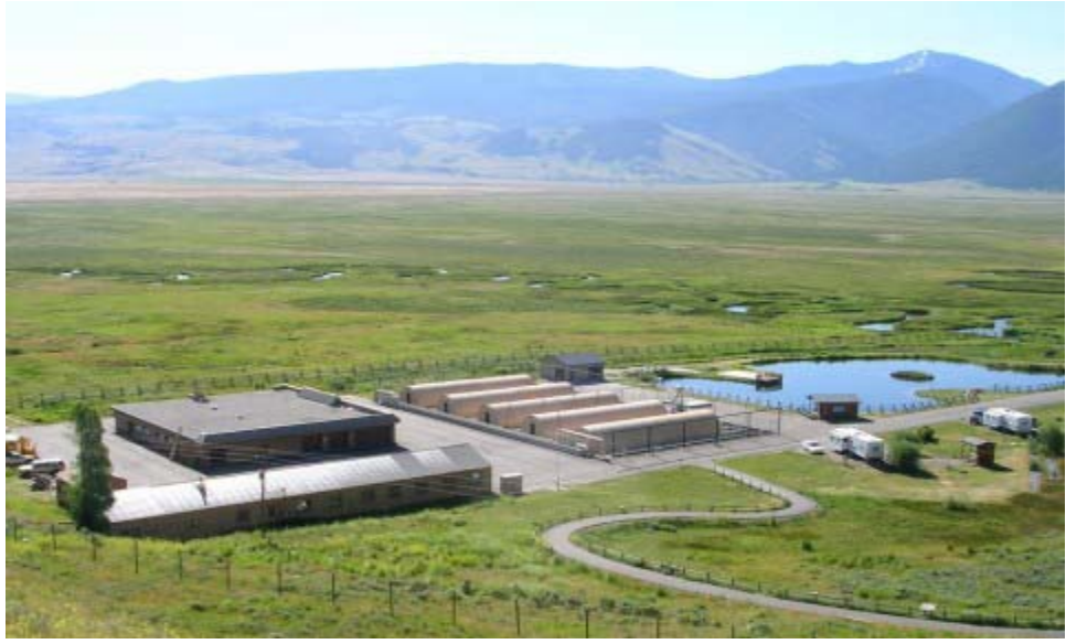
Jackson National Fish Hatchery, Jackson, Wyoming.