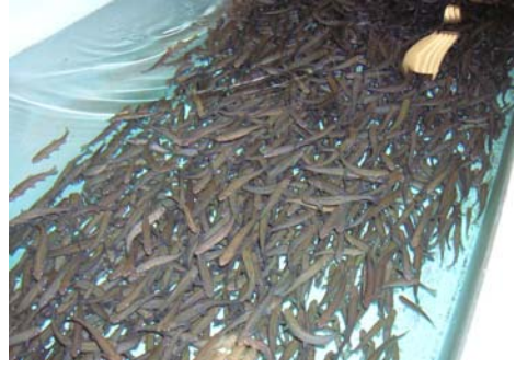
A tank full of small fish (above), and a Snake River Cutthroat Trout (below).