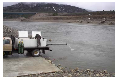
Stocking waters for Palisades Reservoir, Idaho.

The role of the National Fish Hatchery System has changed and diversified greatly over the past 30 years as increasing demands are placed upon aquatic systems. In recent years, the Service has maximized the output of its work force by integrating the work of fish hatcheries and fisheries management. This integrated effort has resulted in cohesive, more efficient national restoration programs.