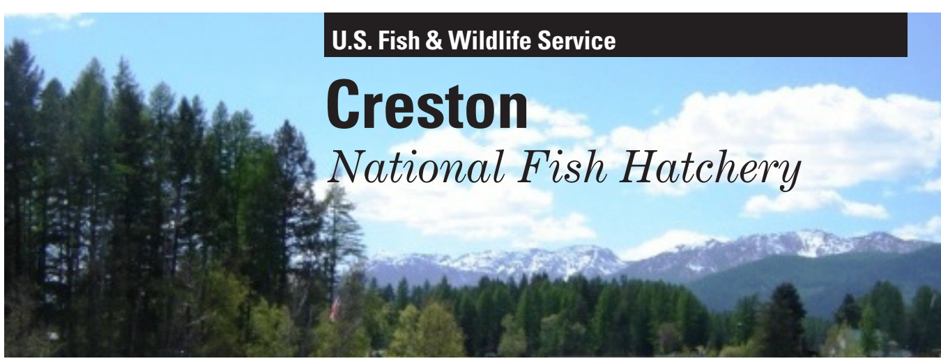
Creston National Fish Hatchery scenery