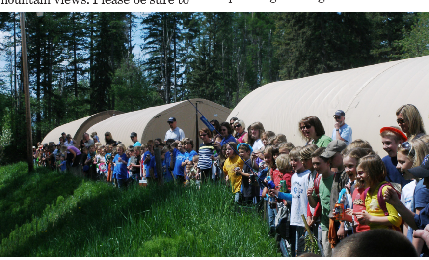
Successful day at Creston NFH National Fish Week Event