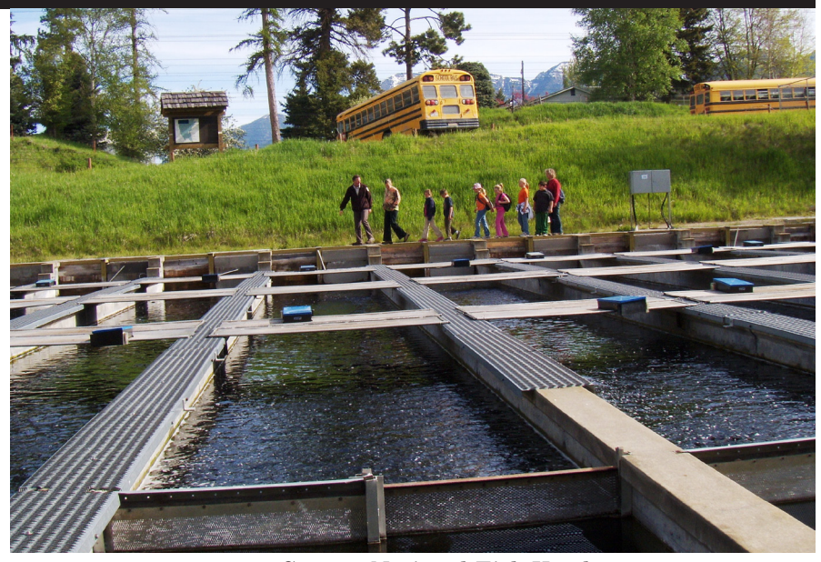
Creston National Fish Hatchery raceways

Educational programs and tours are provided for the public and school groups when scheduled in advance. When visiting the hatchery, be sure to explore additional recreational opportunities around the hatchery. Try your luck fishing on the Mill fishing pond, enjoy a picnic near the Jessup Mill Pond, hike the nature trail, and take in the beautiful mountain views. Please be sure to