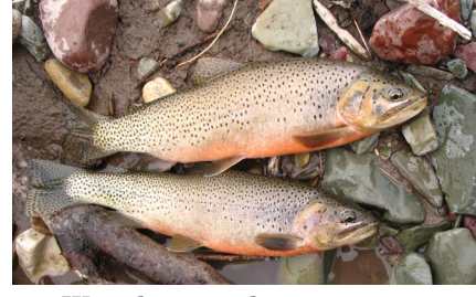
Westslope cutthroat trout

In fiscal year 2010, approximately 870,000 fish were distributed into 80 Tribal and State managed waters. As a result of Creston NFH's stocking efforts, annual economic benefits weigh-in at over 156,000 angler days valued at over $6.69 million! Nearly a hundred jobs are supported as a ripple effect of the hatcheries fish production, with job income exceeding $3 million.