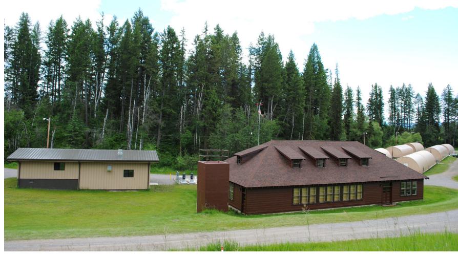
Refurbished hatchery building and new effluent treatment plant

Creston NFH fish production benefits the Montana fishery resource in many ways. Creston is a major producer of quality trout which helps fulfill Tribal and State fishery management