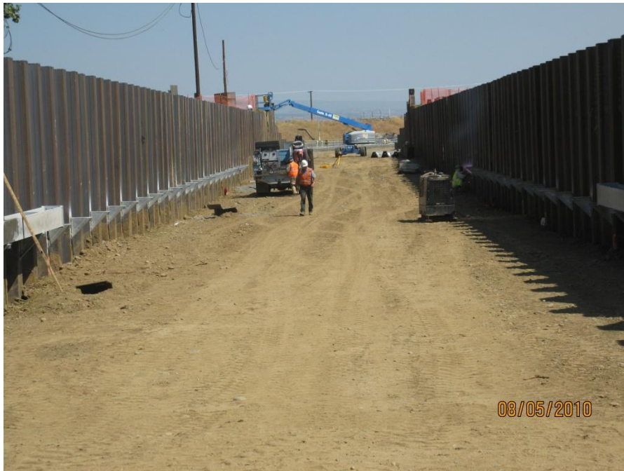
Attaching the braces for walers onto the sheet pile.