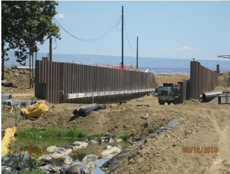
West Bay Builders sheet pile with walers installed.