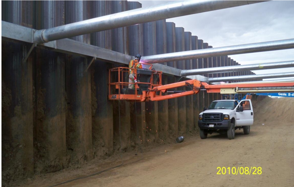
West Bay Subcontractor Blue Iron welding the cap for canal braces.