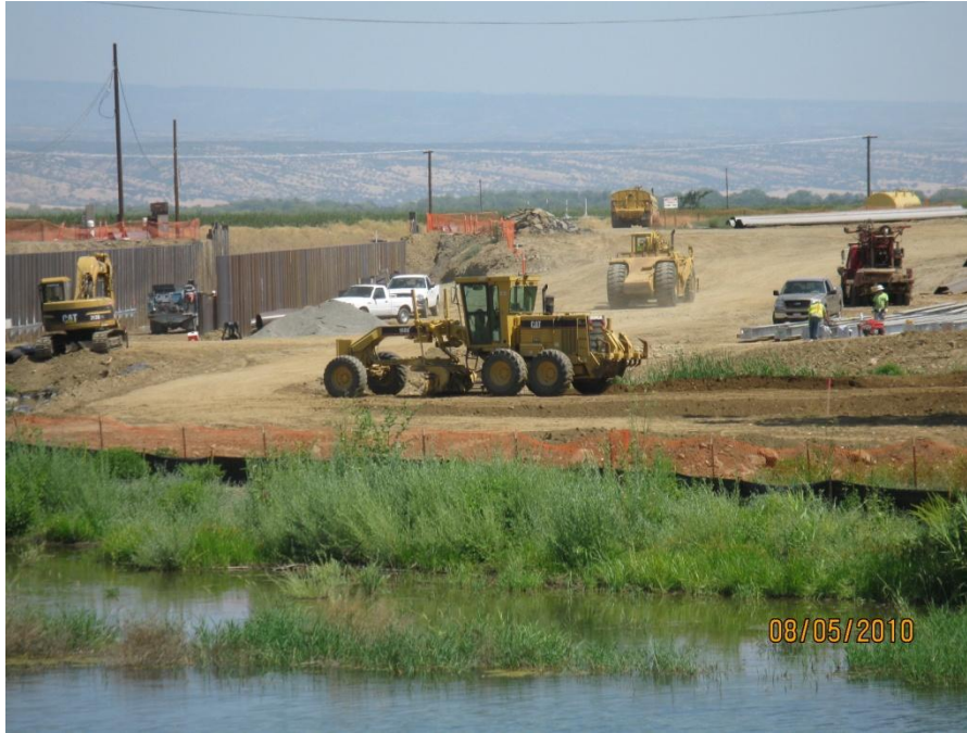
West Bay Builders Subcontractor excavating to install walers for sheet pile support from canal.