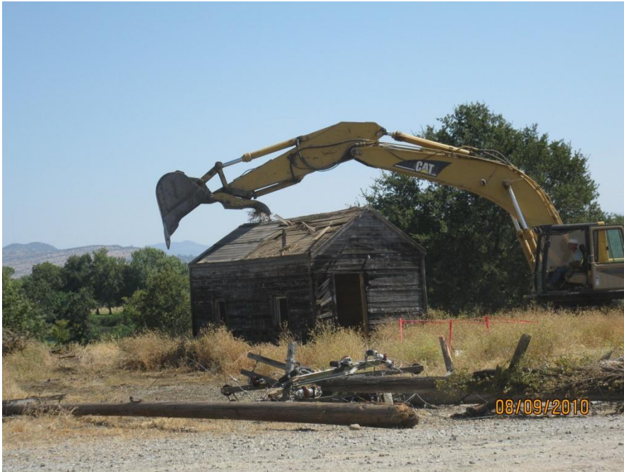
Balfour Beatty Infrastructure clearing and grubbing.