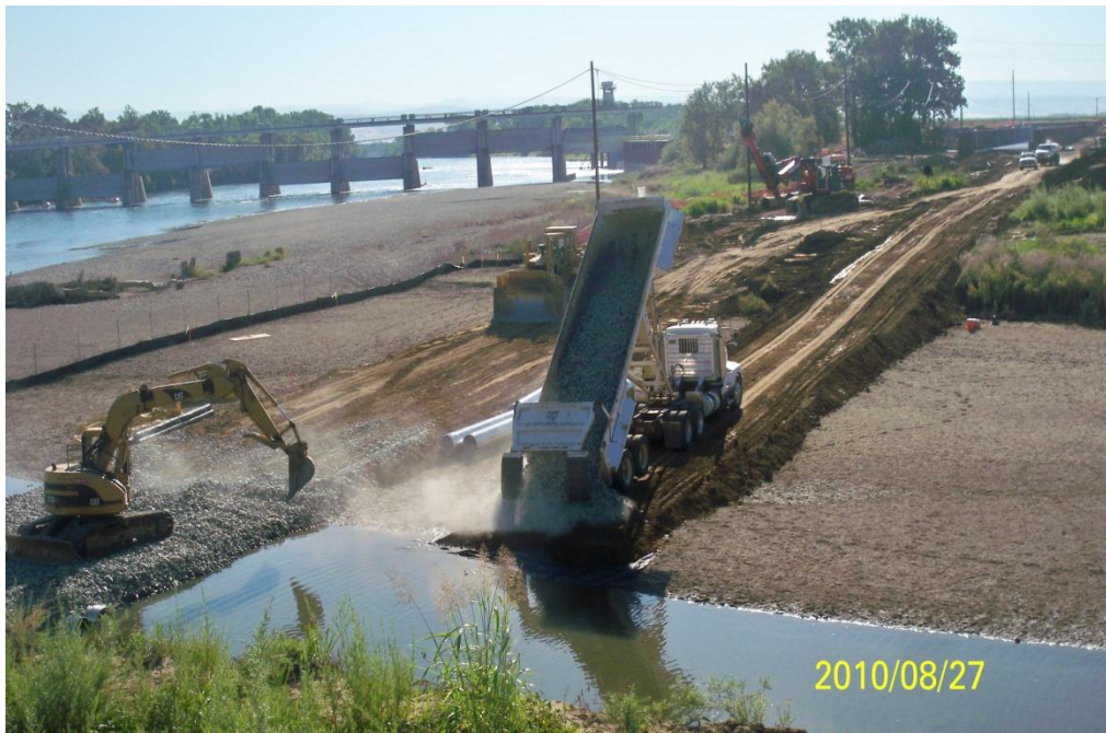
West Bay Subcontractor Meyers building the access road.