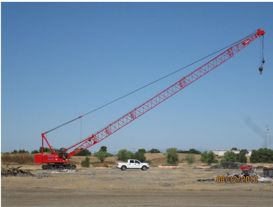
Balfour Beatty crane to be used for sheet pile operations.