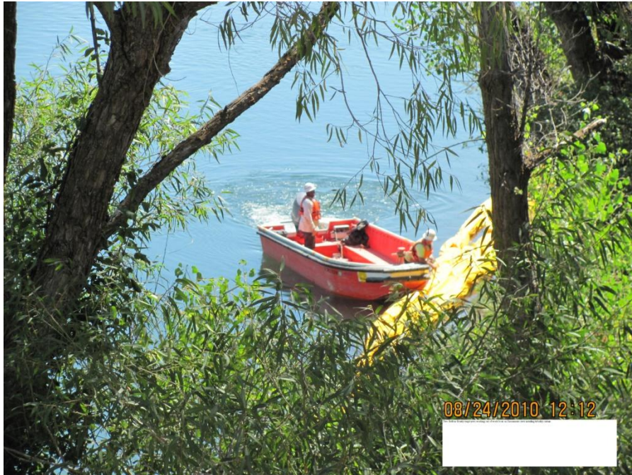
Balfour Beatty working on the silt turbidity curtain.