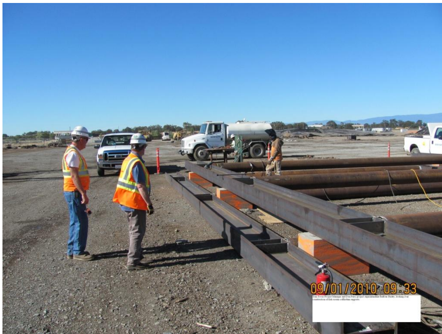
Balfour Beatty assembly work for cofferdam supports.