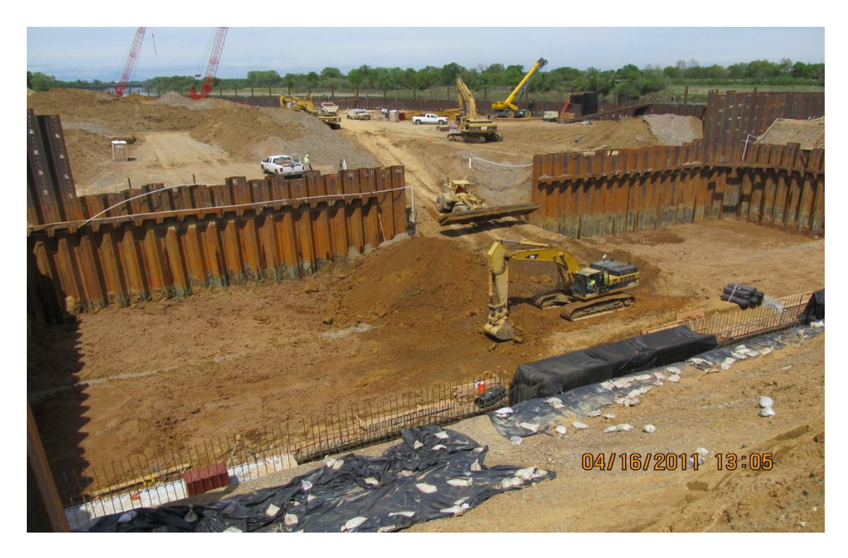
Balfour Beatty subcontractor Meyers excavating to sub grade in the pumping plant.