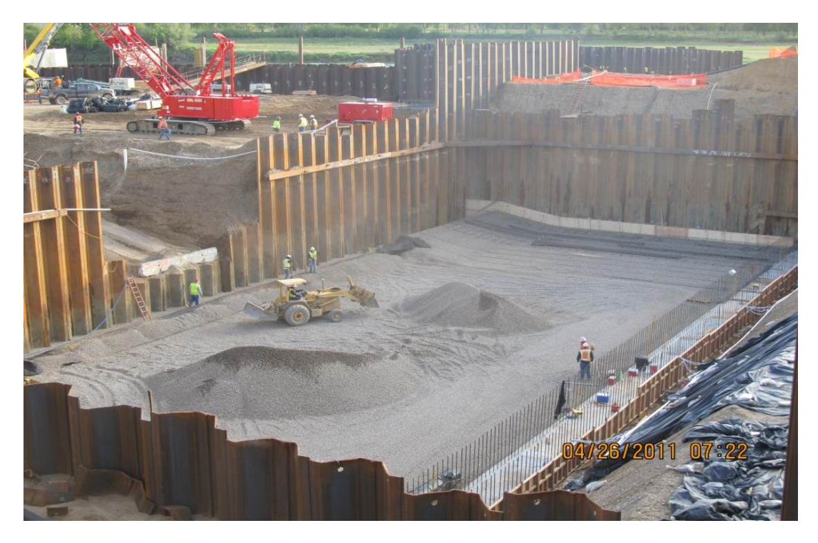
Balfour Beatty placing crushed rock over geotextile for pumping plant sub-base.