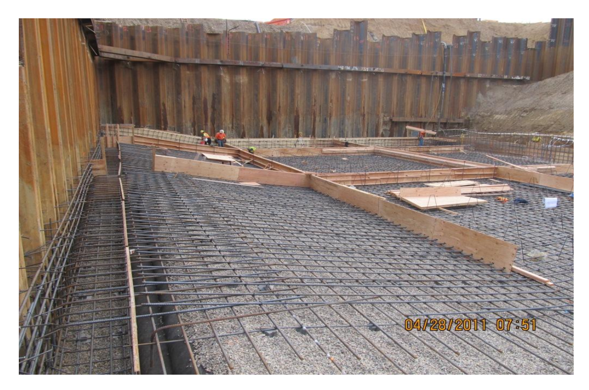
Balfour Beatty bottom mat of reinforcing steel and formwork for pumping plant slab.