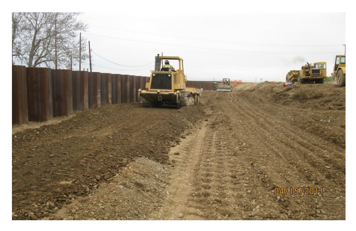
West Bay subcontractor Meyers backfilling south side of downstream canal.