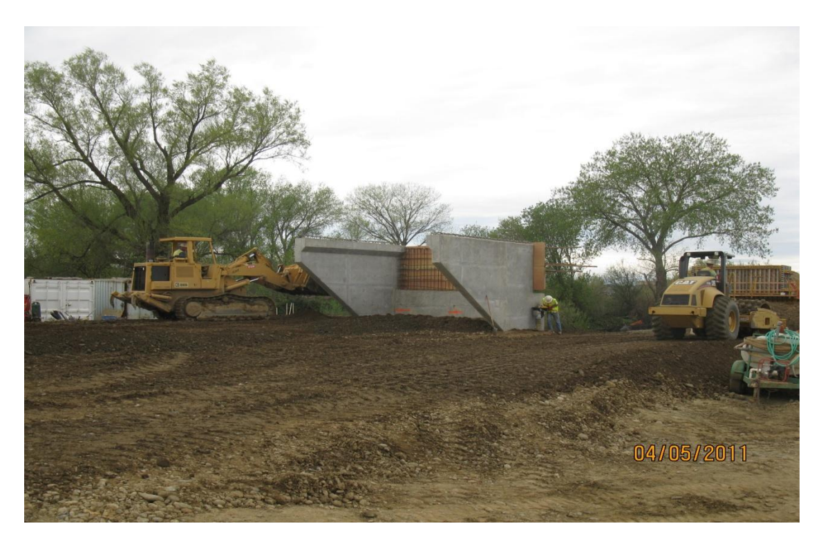
West Bay Builder's subcontractor Meyers backfilling east bridge abutment.