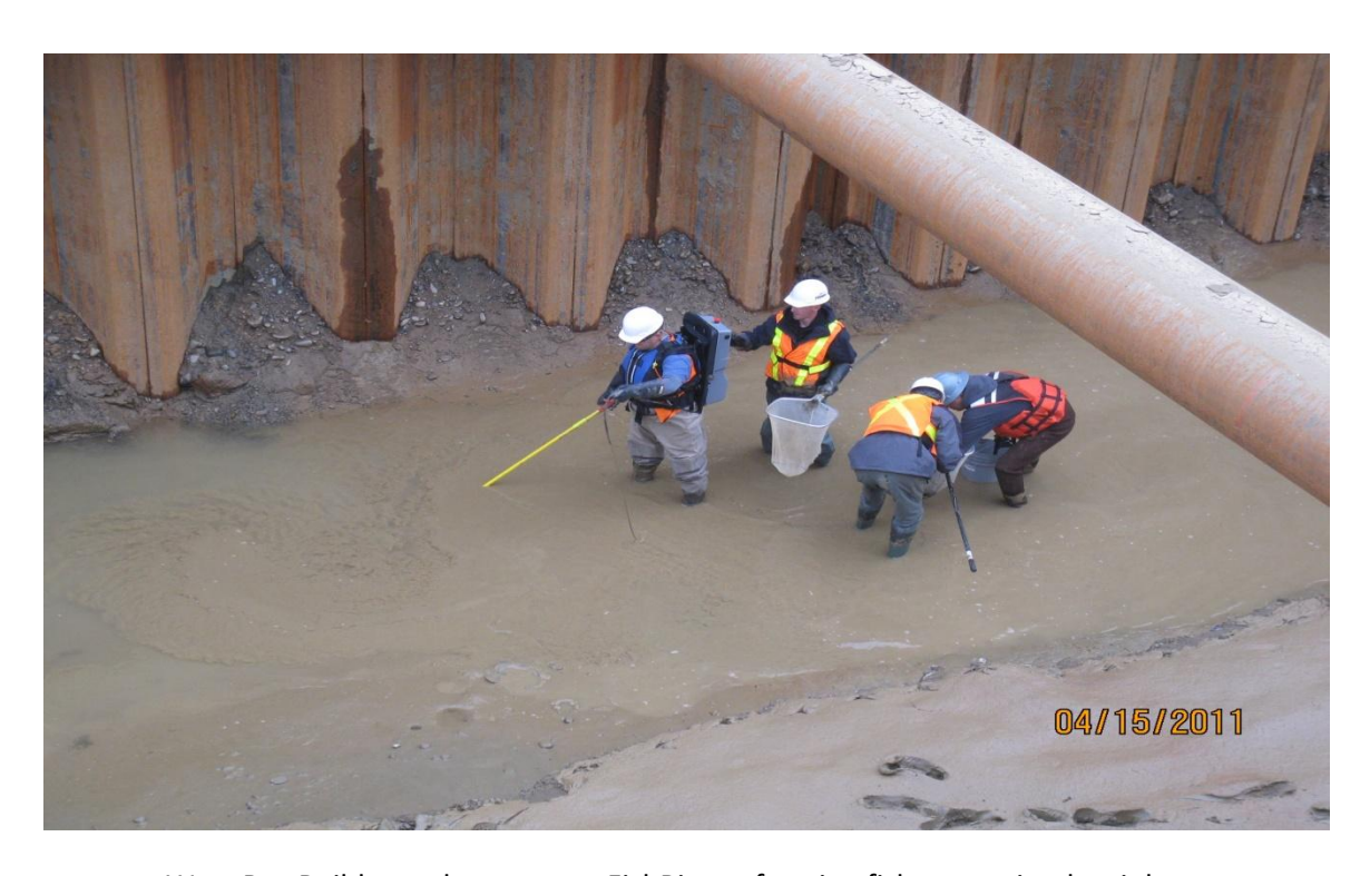
West Bay Builders subcontractor FishBio performing fish rescue in the siphon.