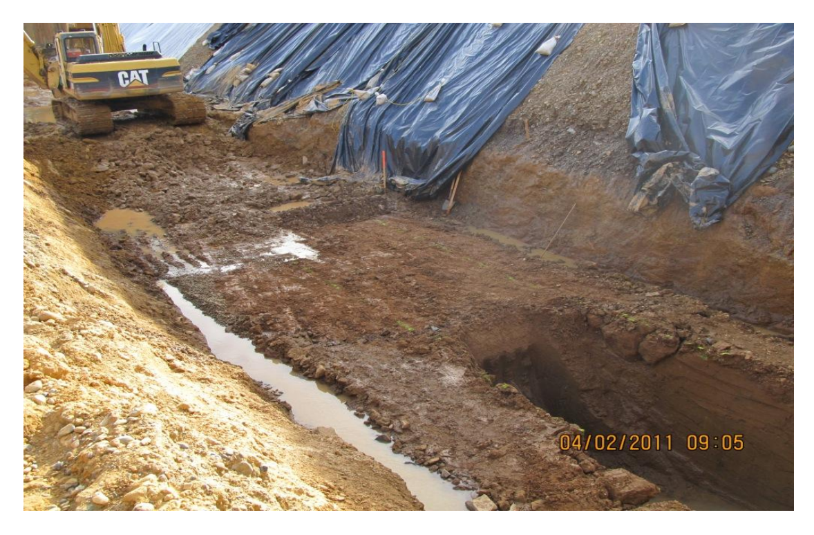
Balfour Beatty excavating pumping plant keyway trench.