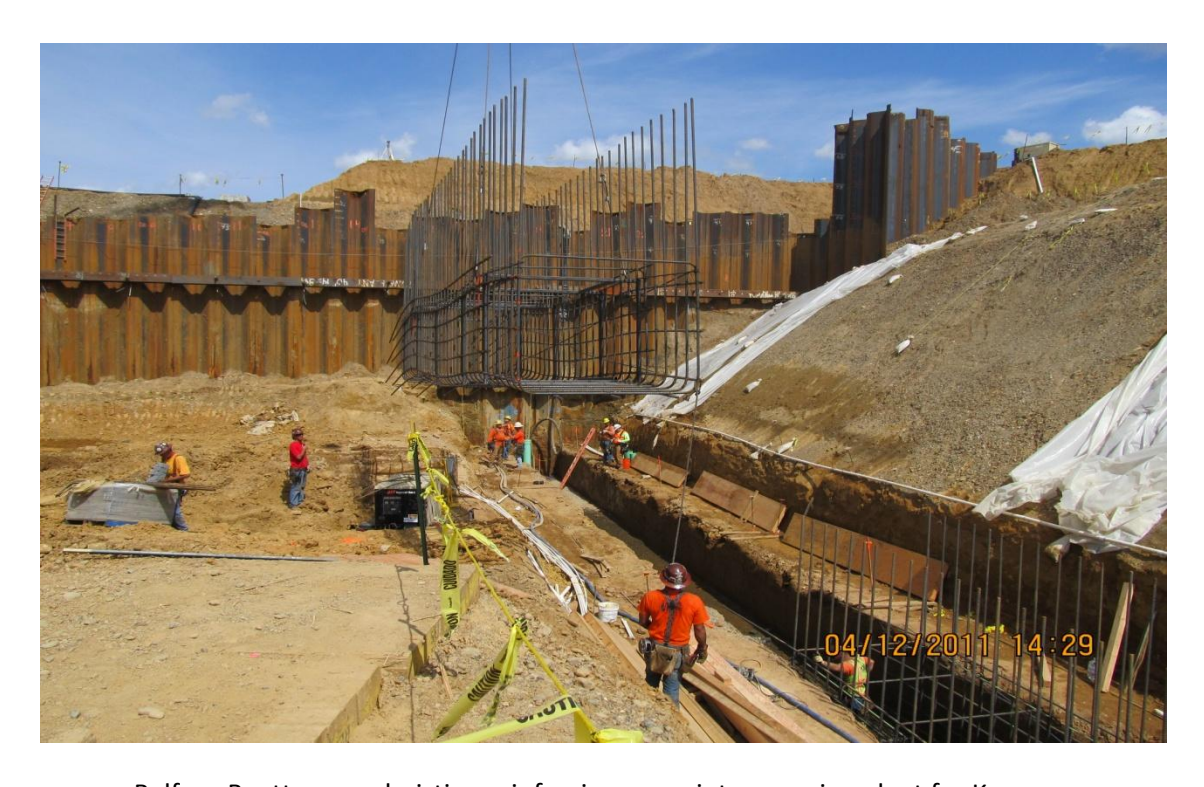
Balfour Beatty crane hoisting reinforcing cages into pumping plant for Keyway.