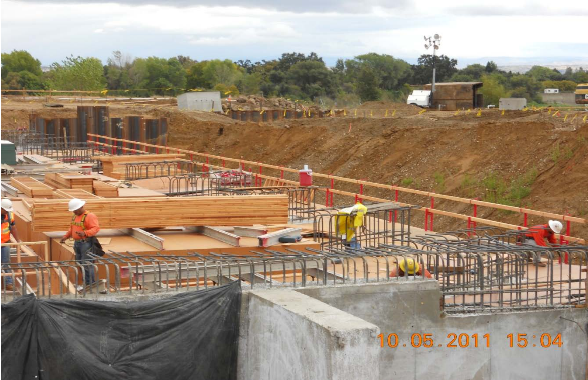
Balfour Beatty subcontractor Upright Shoring installing decking at Pumping Plant.