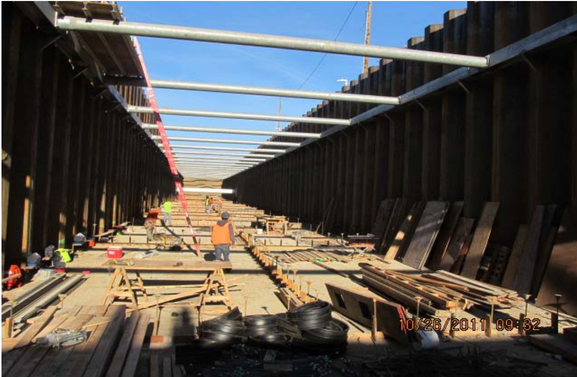
West Bay Builders crews placing forms and water stop for Upstream Canal slabs.