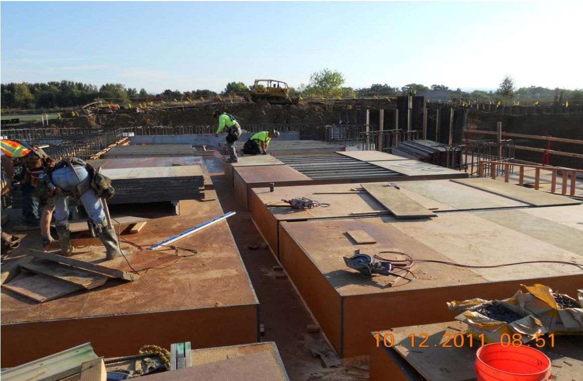
Balfour Beatty subcontractor Upright Shoring installing deck shoring and planking on Afterbay Deck.