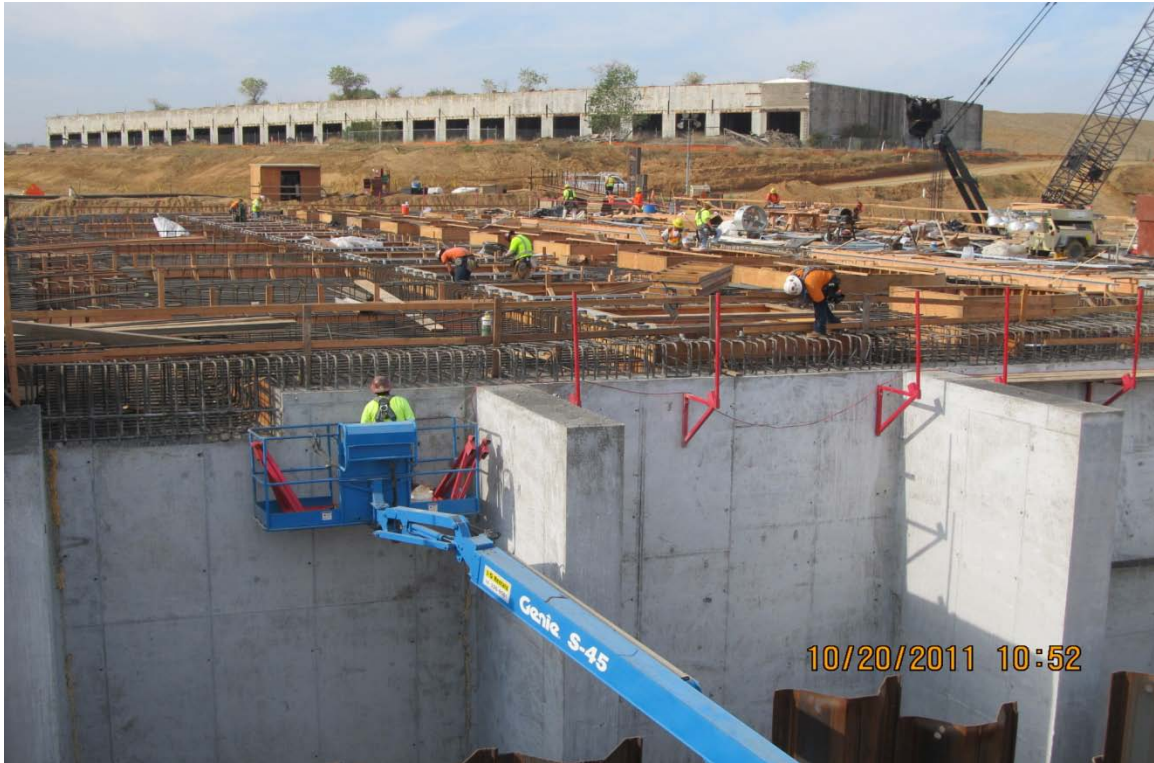
Balfour Beatty overview of Pumping Plant deck and exterior wall.