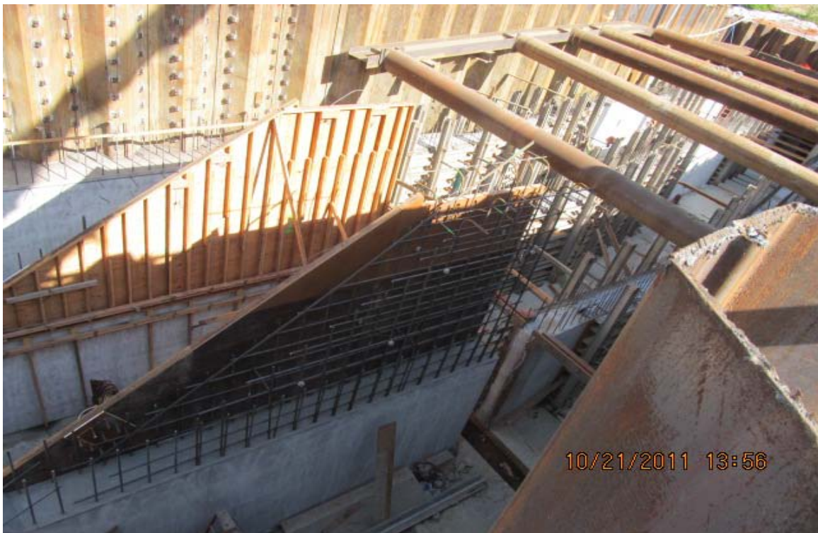
West Bay Builders carpenter crew installing formwork for inlet structure.