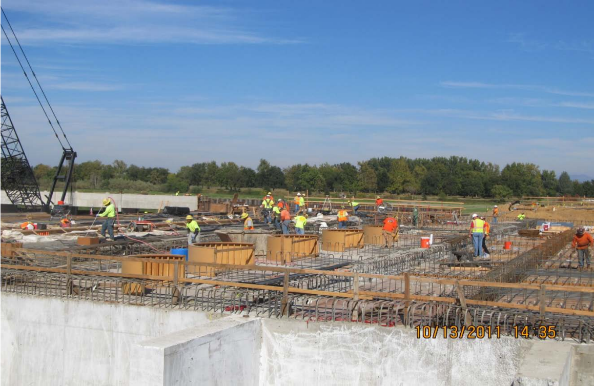
Balfour Beatty working on deck placements and installing pump motor block outs.