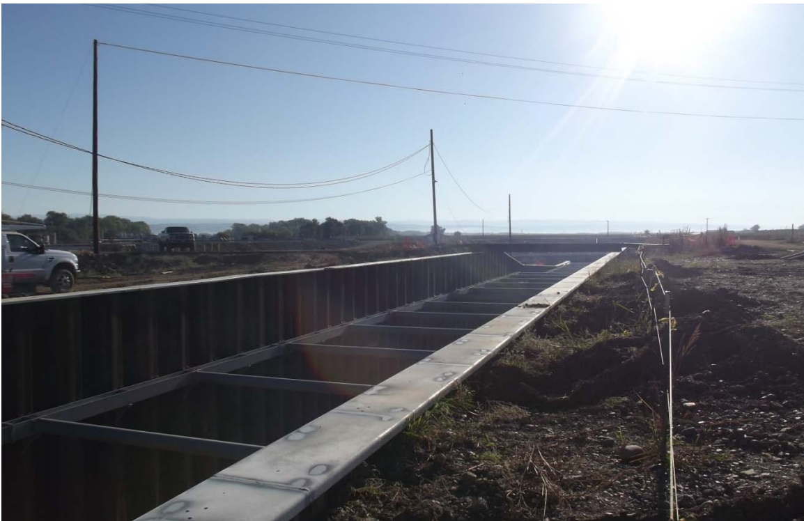
West Bay Builders sheet pile cap at the Downstream Canal Structure installed by subcontractor Blue Iron