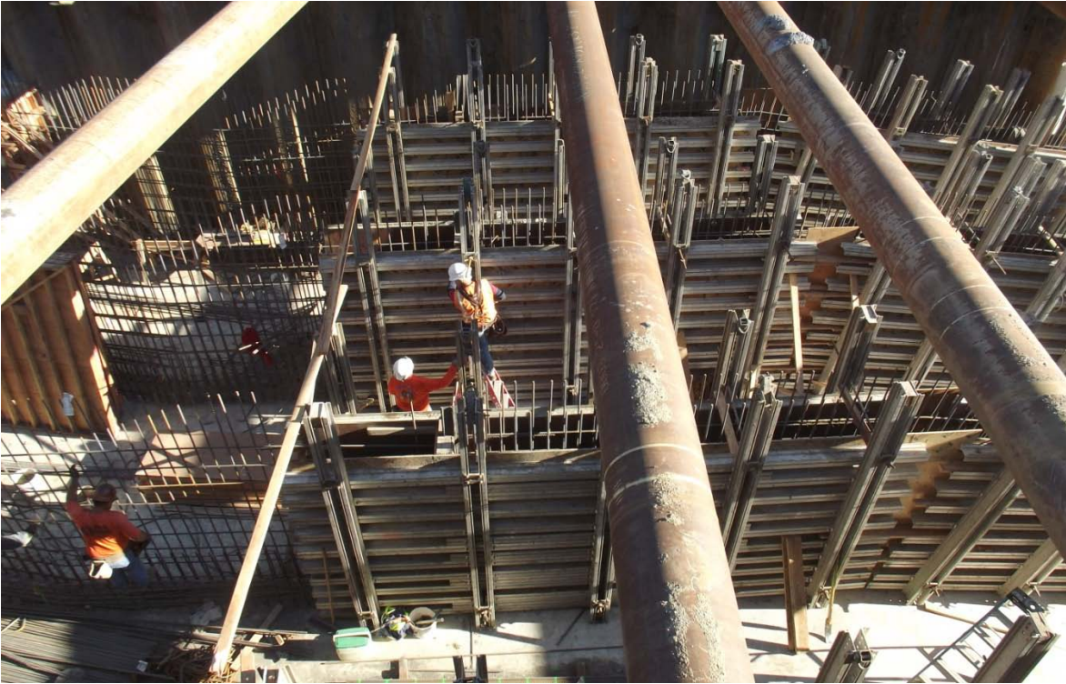
West Bay Builders carpenter crew bracing the Siphon Phase 3 interior walls.