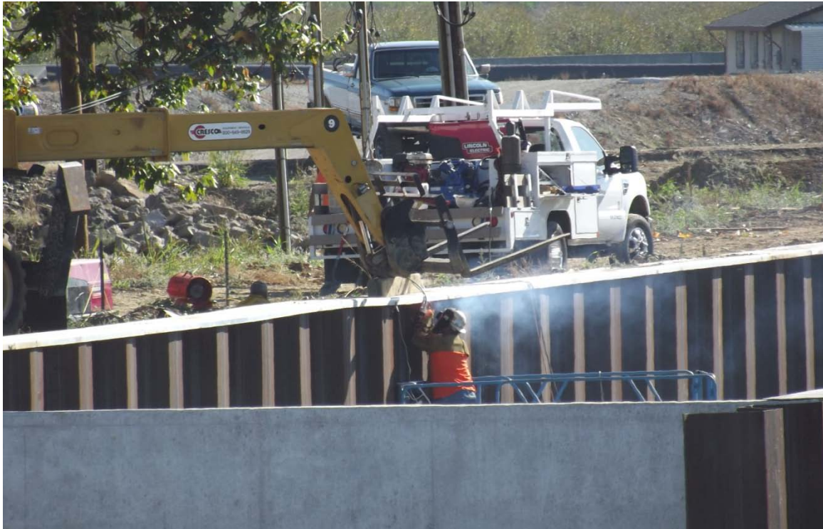
West Bay Builders subcontractor Blue Iron welding sheet pile caps at the Downstream Canal Structure.