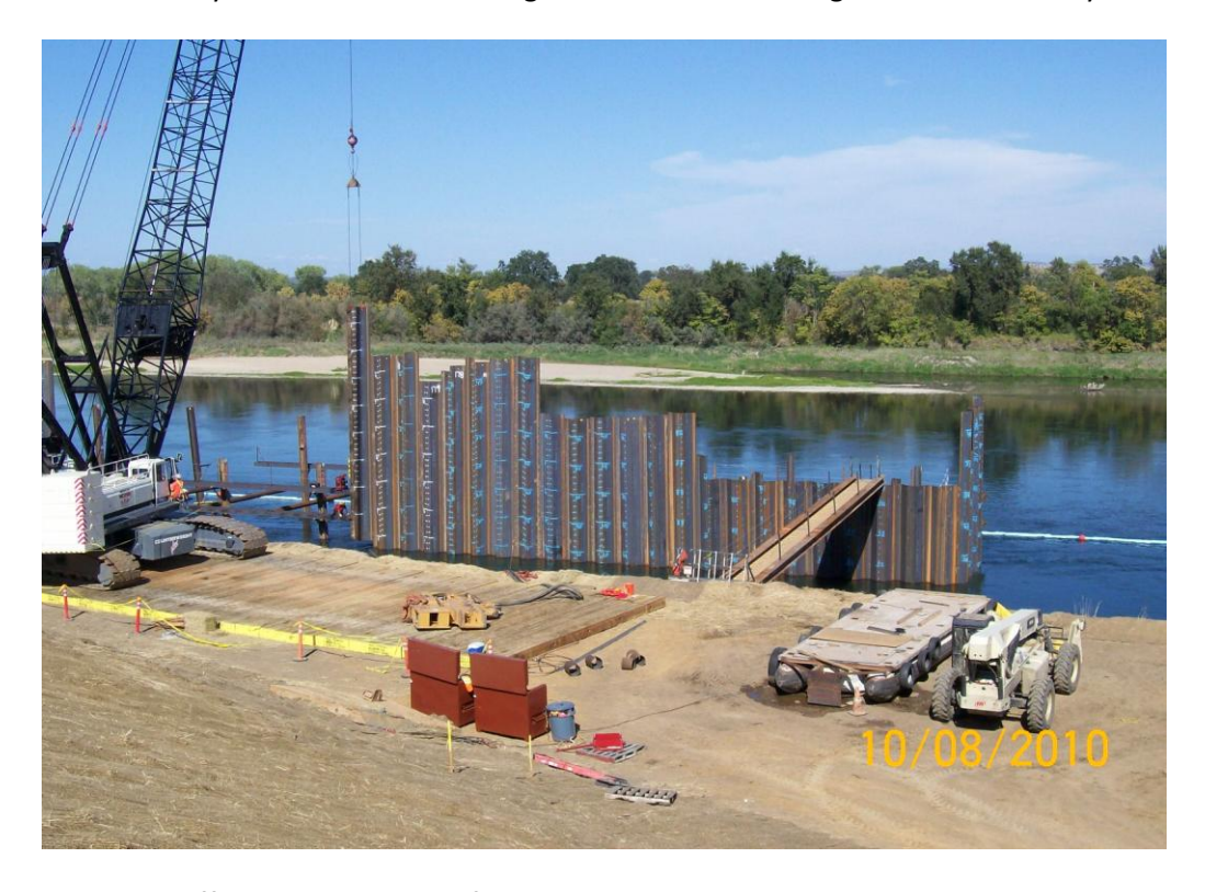
Installing Cofferdam Sheet Piling for Fish Screen Bay 14