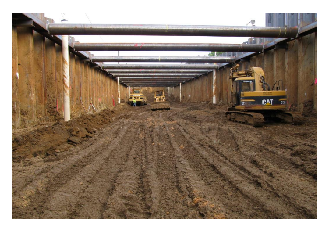
West Bay Subcontractor Excavating Siphon Structure