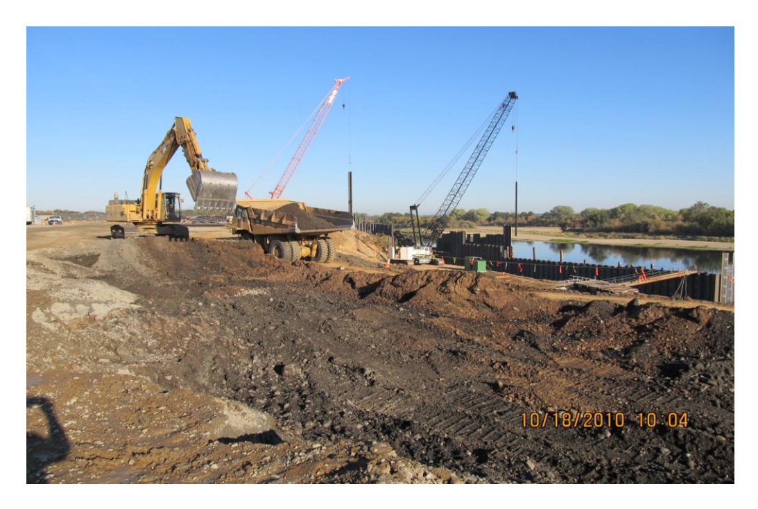
Pacific States Construction Excavating from Pumping Plant and Fish Screen