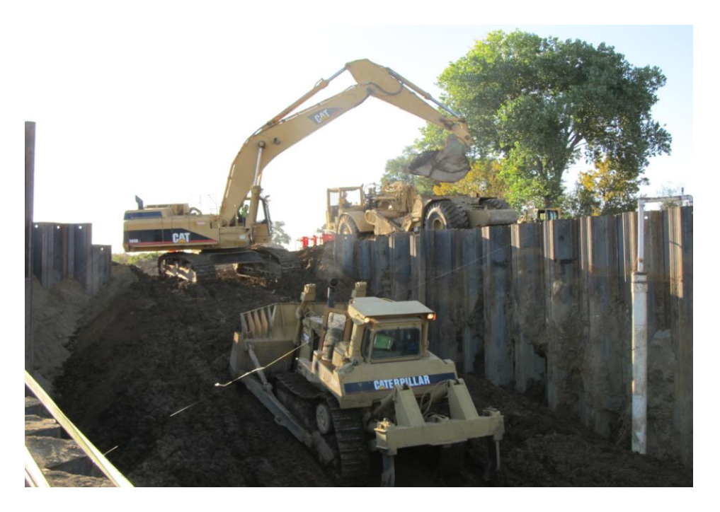
West Bay Builders Subcontractor Meyers' Dozer Pushing Material to Excavator to Load on Scraper