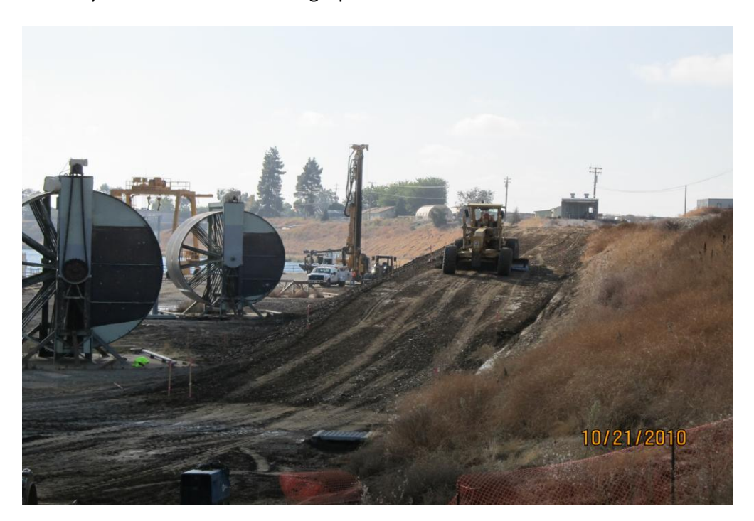
Access Ramp Earth Fill