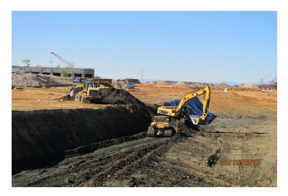
PACTIV Landfill Excavation