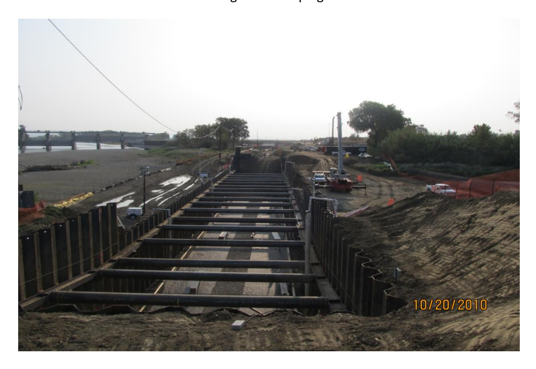
Siphon Barrel Structure