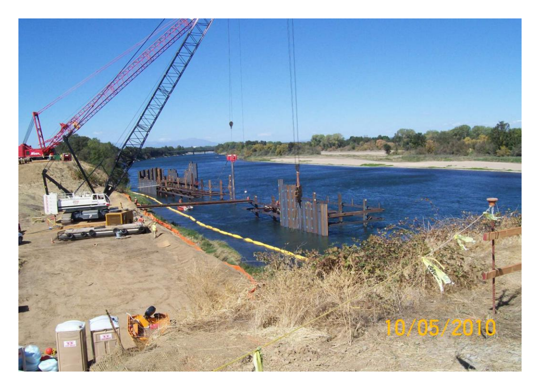
Balfour Beatty Infrastructure Installing Cofferdam Sheet Piling for Fish Screen Bay 1 to 14