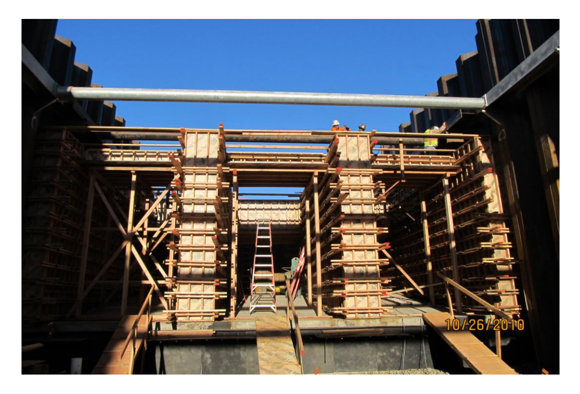
Siphon Outlet Structure