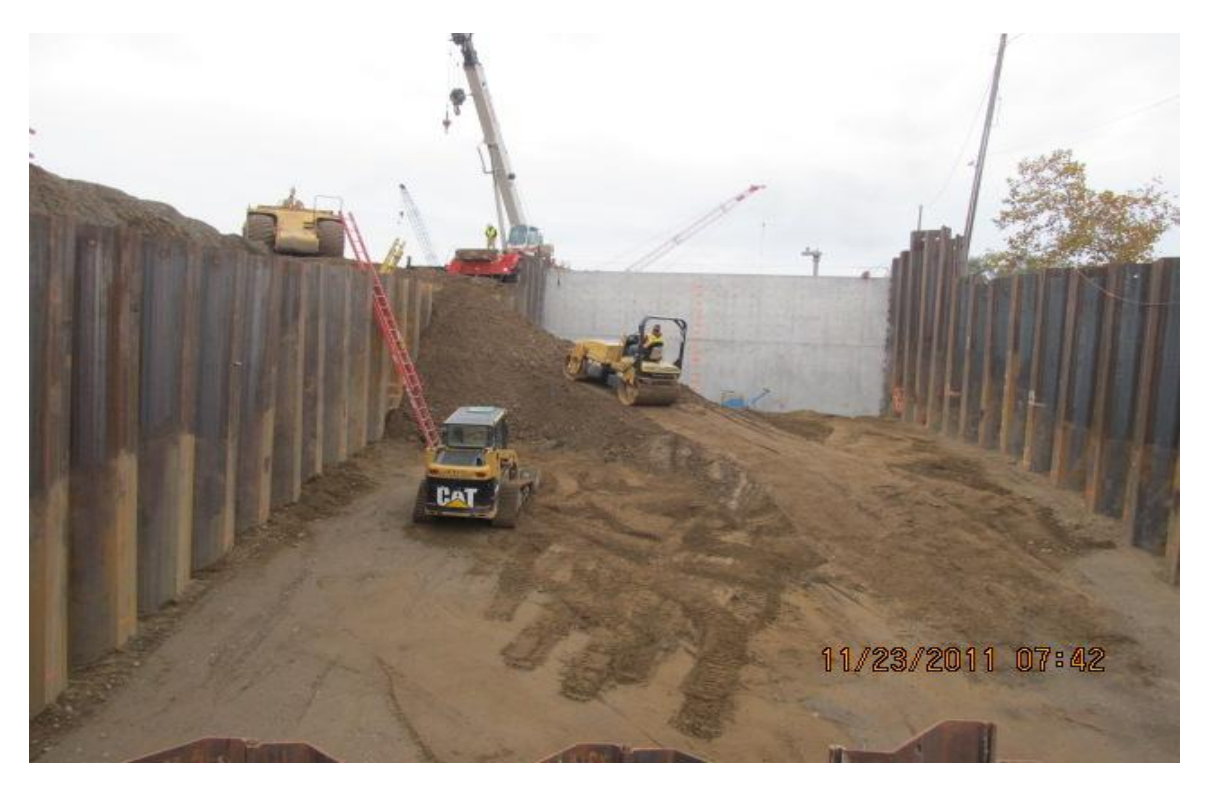
West Bay Builders subcontractor Meyers compacting backfill material to be used as an access ramp.