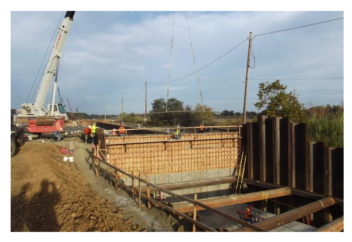
West Bay Builders carpenter crew finishing installation of forms for inlet structure.