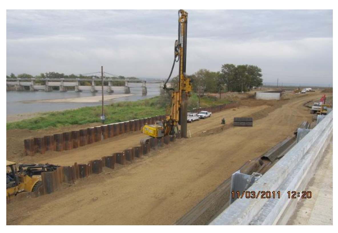
West Bay Builders subcontractor Hughes Construction removing temporary sheet pile.