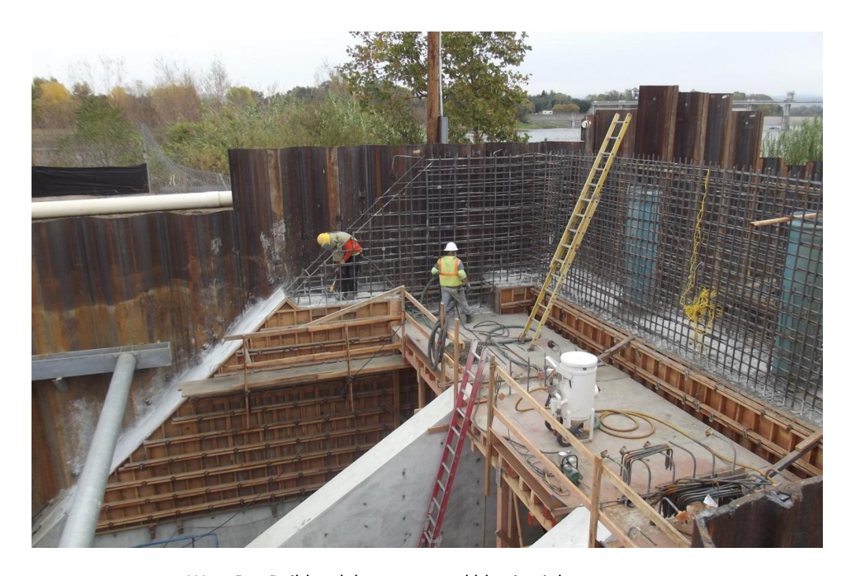
West Bay Builders labor crew sand blasting inlet structure.