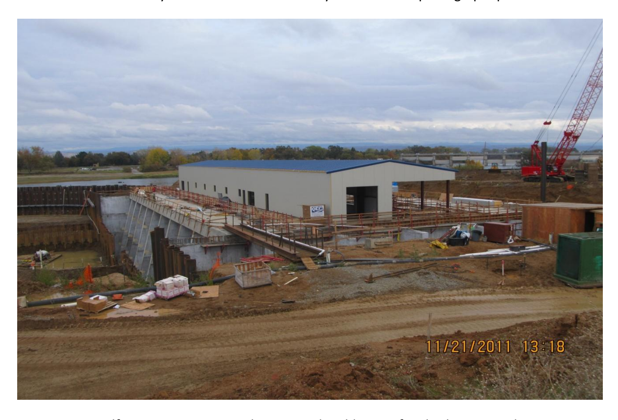
Balfour Beatty Pumping Plant Control Building roof and siding erected.