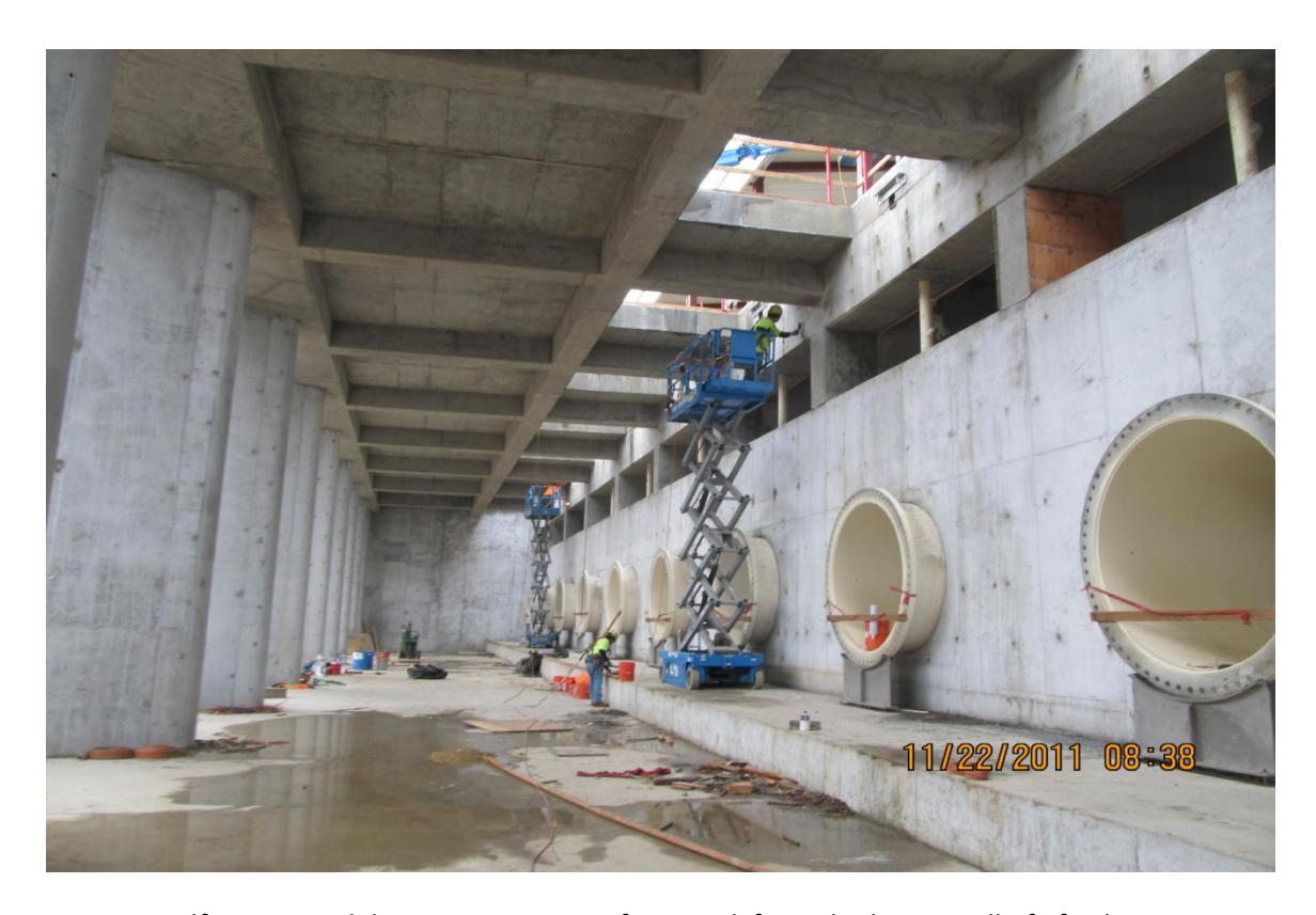
Balfour Beatty labor crew removing formwork from discharge wall of afterbay.