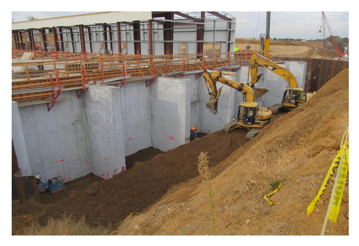
Balfour Beatty subcontractor Meyers Earthwork back filling at pumping plant.