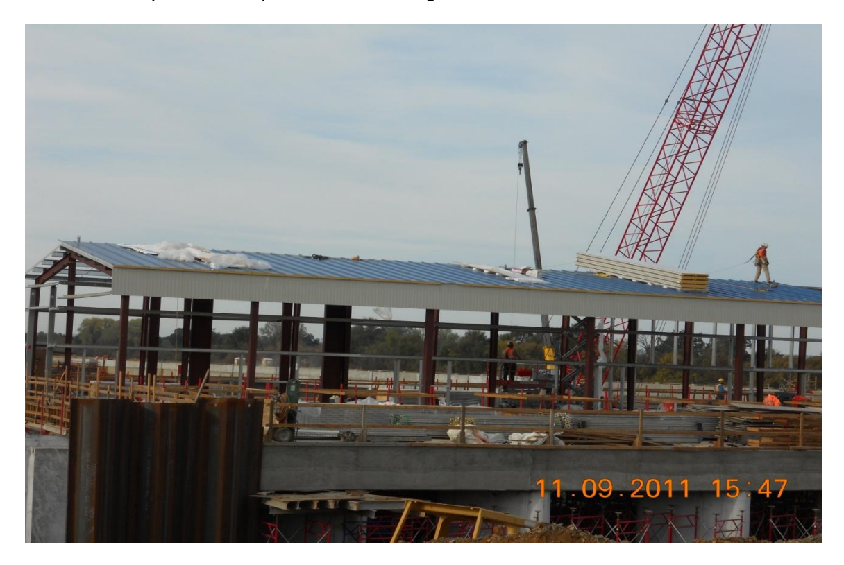
Balfour Beatty sub contractor Quality Erectors installing roof panels on Pumping Plant Control Building.