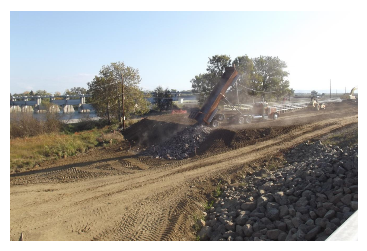
West Bay Builder subcontractor Meyers Earthwork placing rip rap.