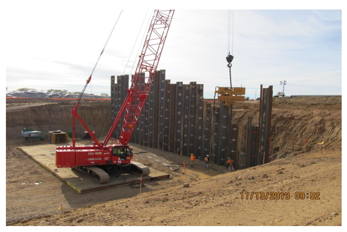
Driving Pumping Plant Sheet Piling for South Wall