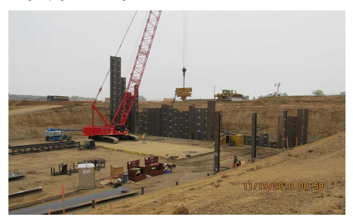
Installation of Excavation Support and Protection Sheet Piling