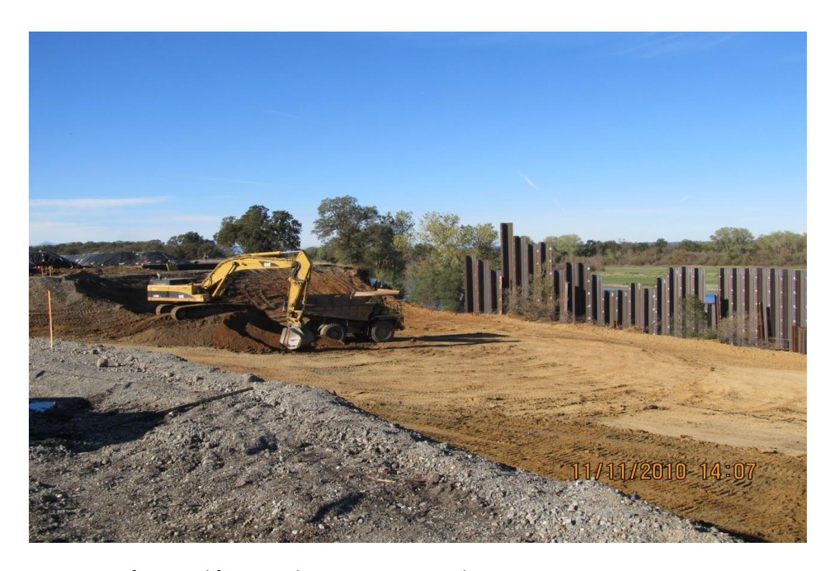
Excavation of Material from Forebay at Upstream End