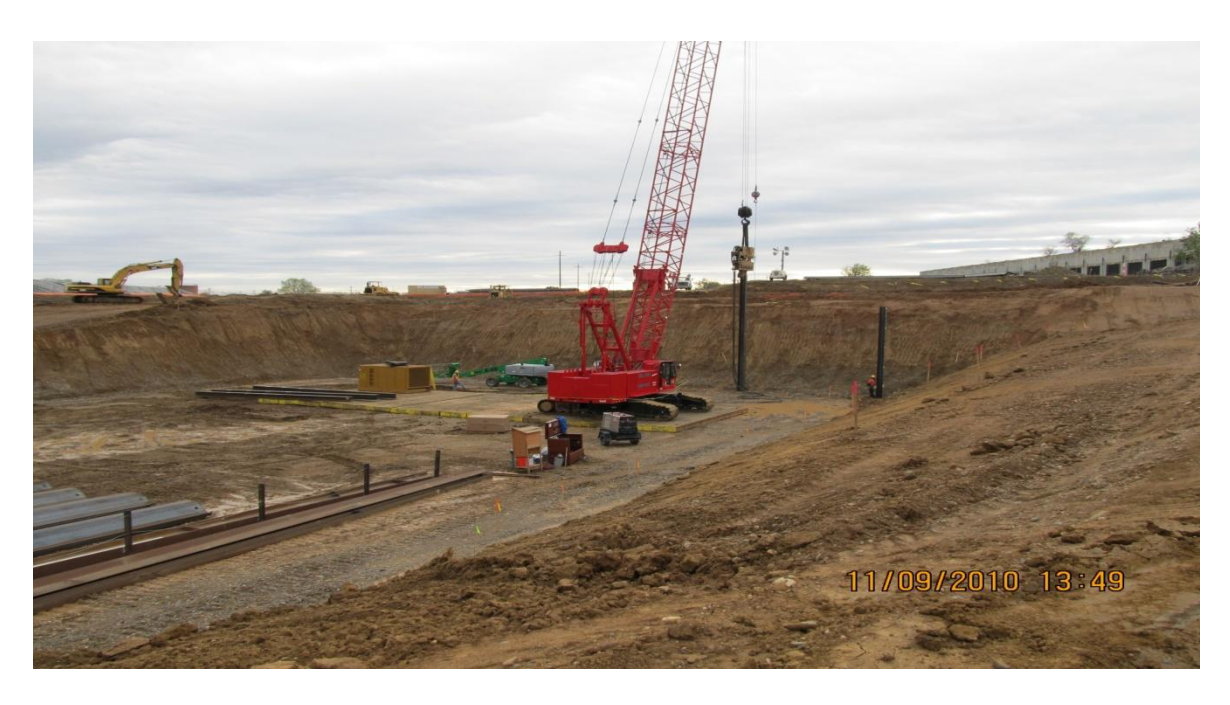
Placing H (pin) Piles for Pumping Plant Sheet Piling Guides