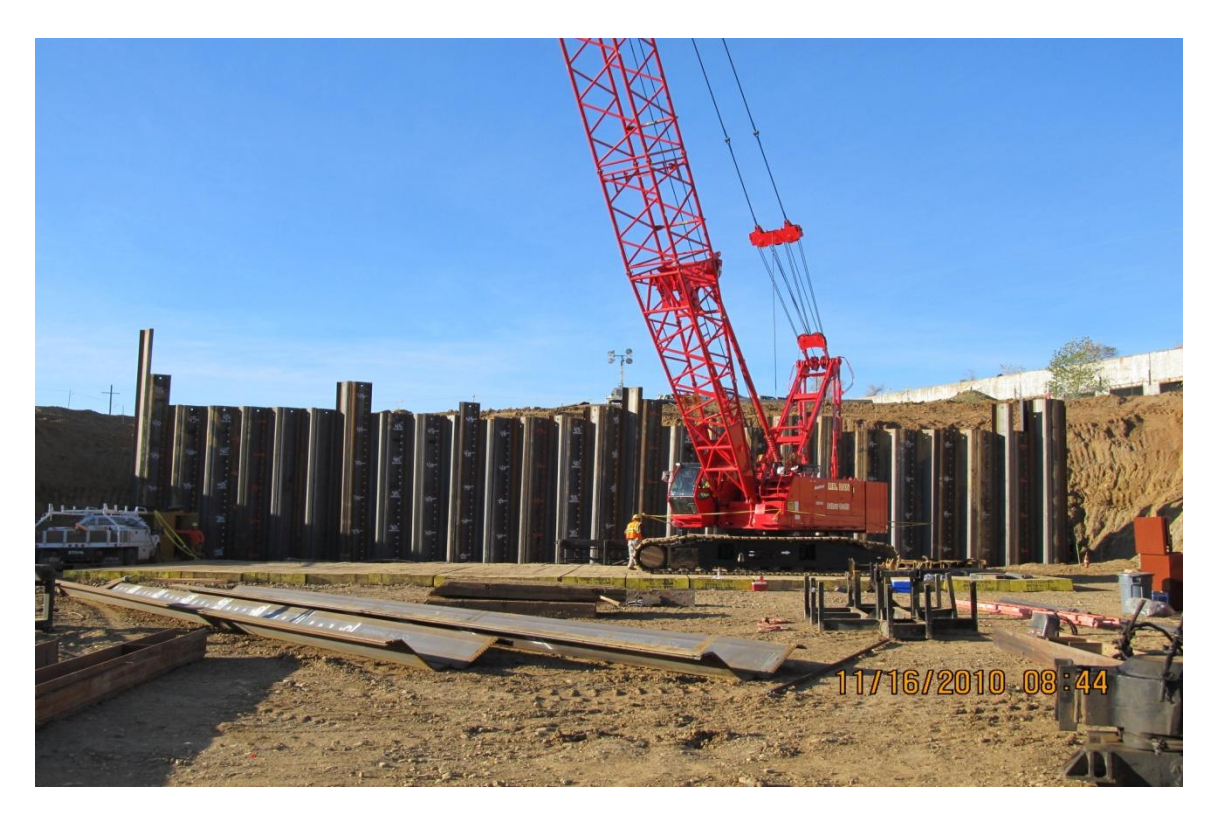
Driving Pumping Plant Sheet Piling for South Wall