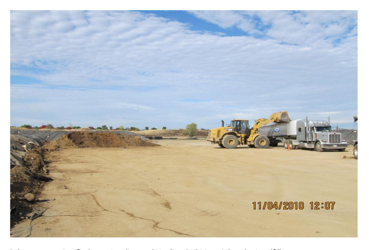
Subcontractor Pacific States Loading and Hauling Soil Material to the Landfill