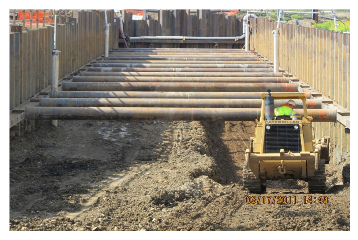
West Bay Builders subcontractor Meyers begins excavating the 2<sup>nd</sup> lift for Phase 2 Siphon excavation.