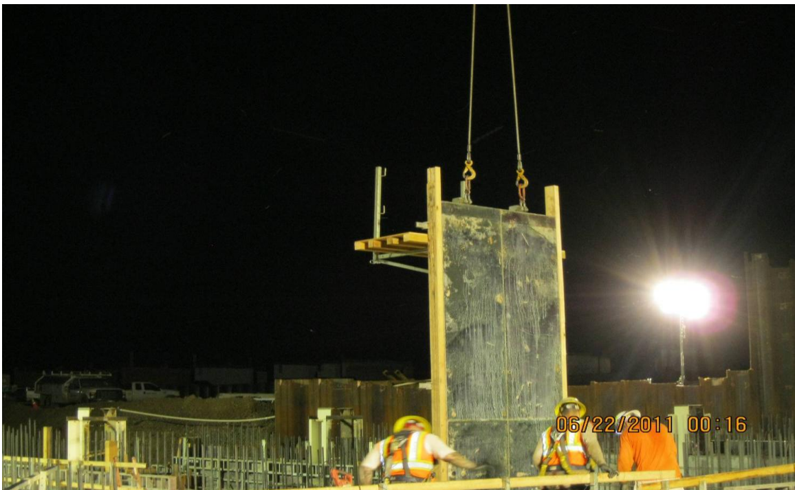
Balfour Beatty night shift setting back wall forms.