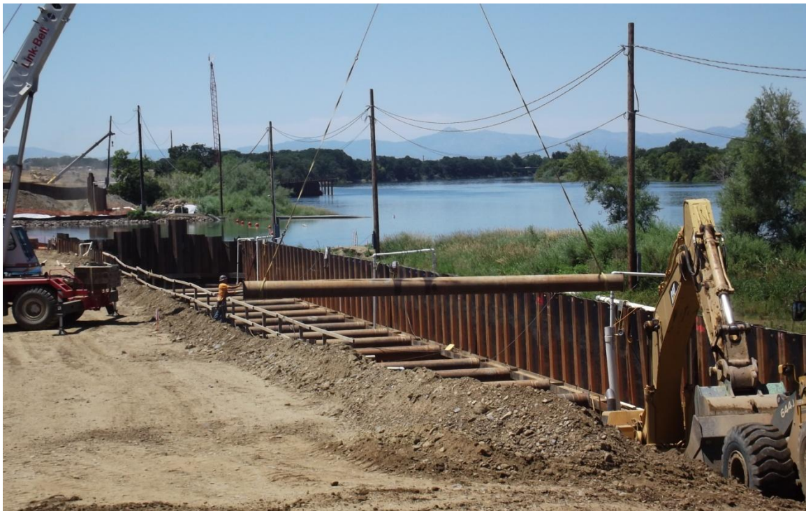
West Bay Builders installing temporary struts for the siphon.