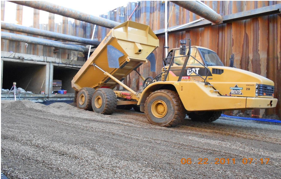
West Bay Builders subcontractor Meyers placing gravel fill at the siphon.