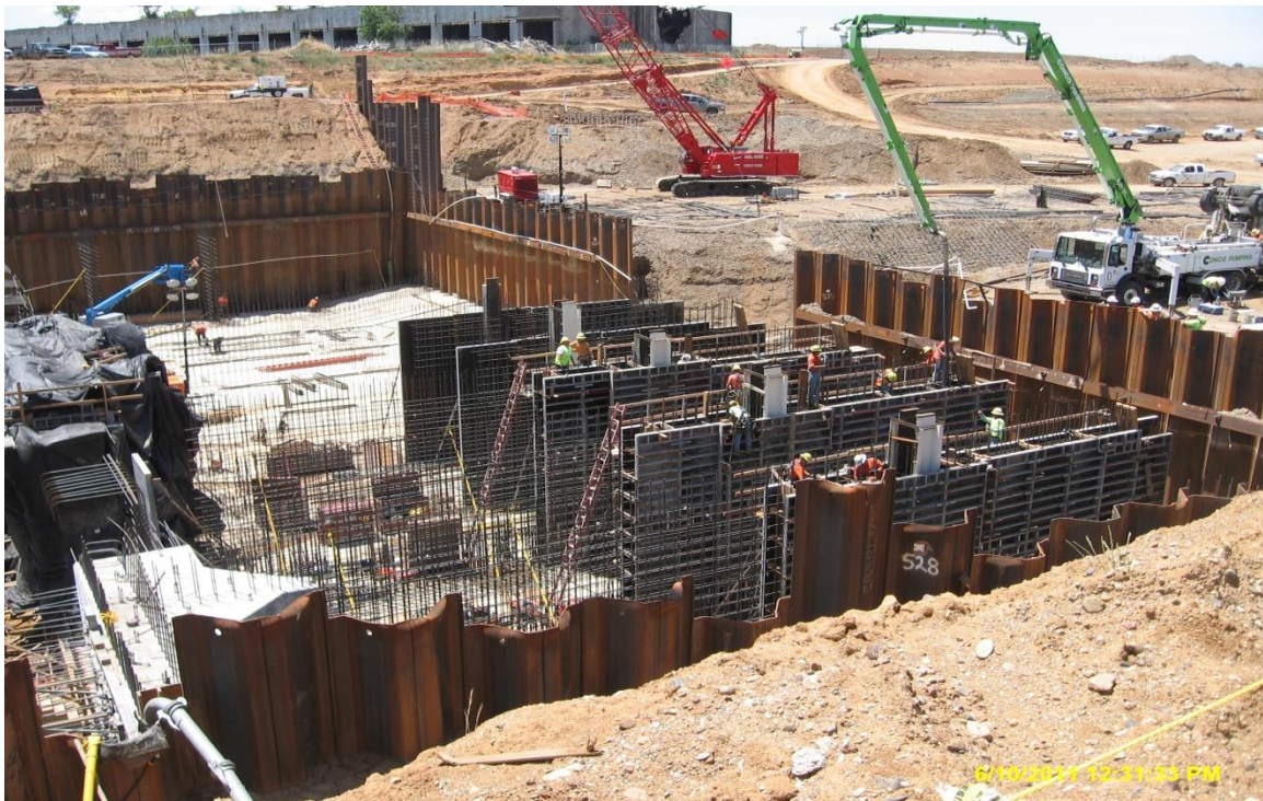
Balfour Beatty pumping plant overview looking towards forebay bank.