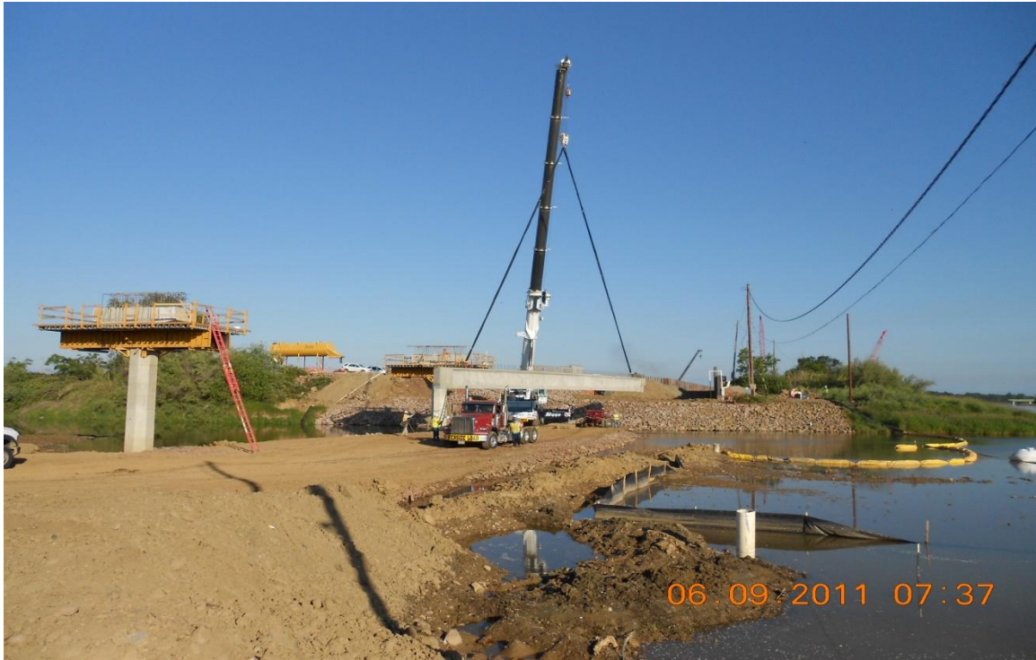
West Bay Builders installing bridge girders.