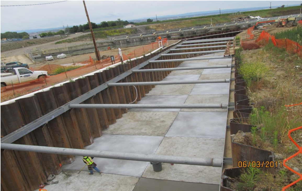
West Bay Builders downstream structural concrete.