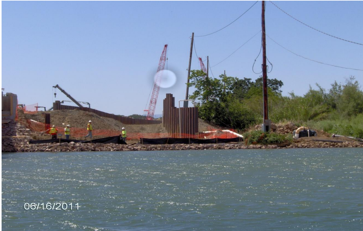
West Bay Builders installing silt fence to comply with Stormwater Pollution Prevention Plan.