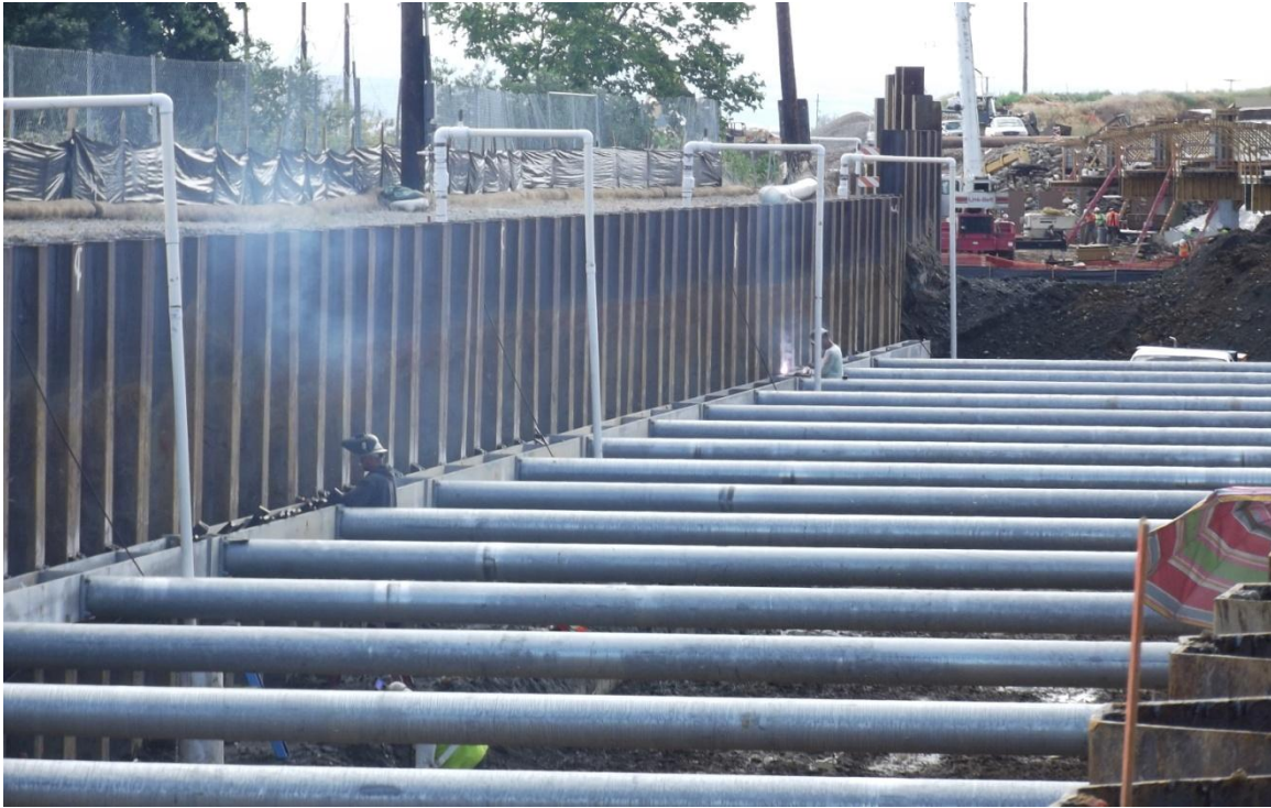
West Bay Builders subcontractor Blue Iron installing upstream canal shoring system.