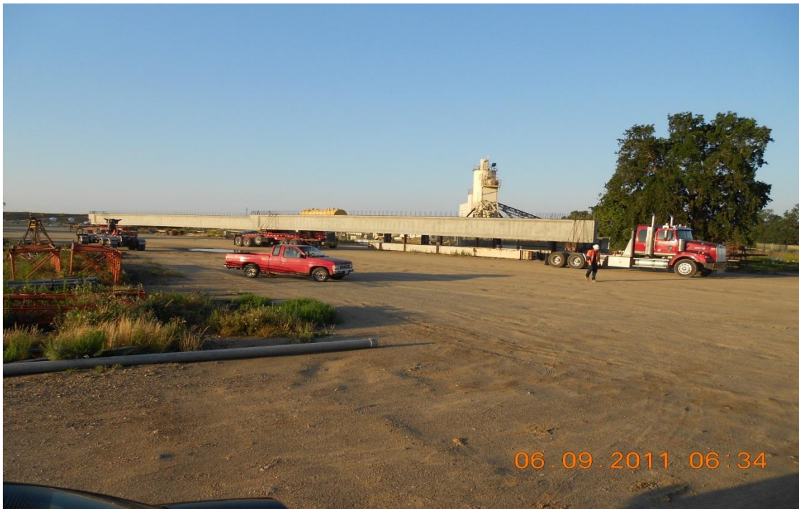
West Bay Builders delivering bridge girders.