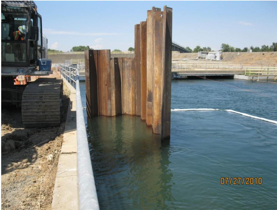
Cofferdam of sheet piles for the connection to the existing settling basin of the Tehama-Colusa Canal.