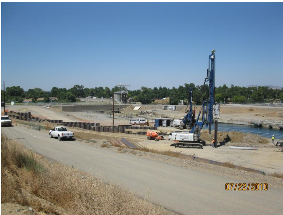
Driving sheet piles near the existing Tehama-Colusa & Tehama-Corning Canal settling basin.