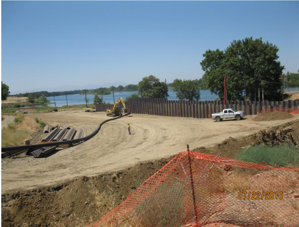
Setting up dewatering for canal on the east side of Red Bank Creek.