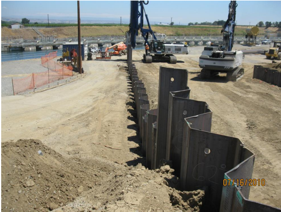
Driving sheet piles towards the settling basin.