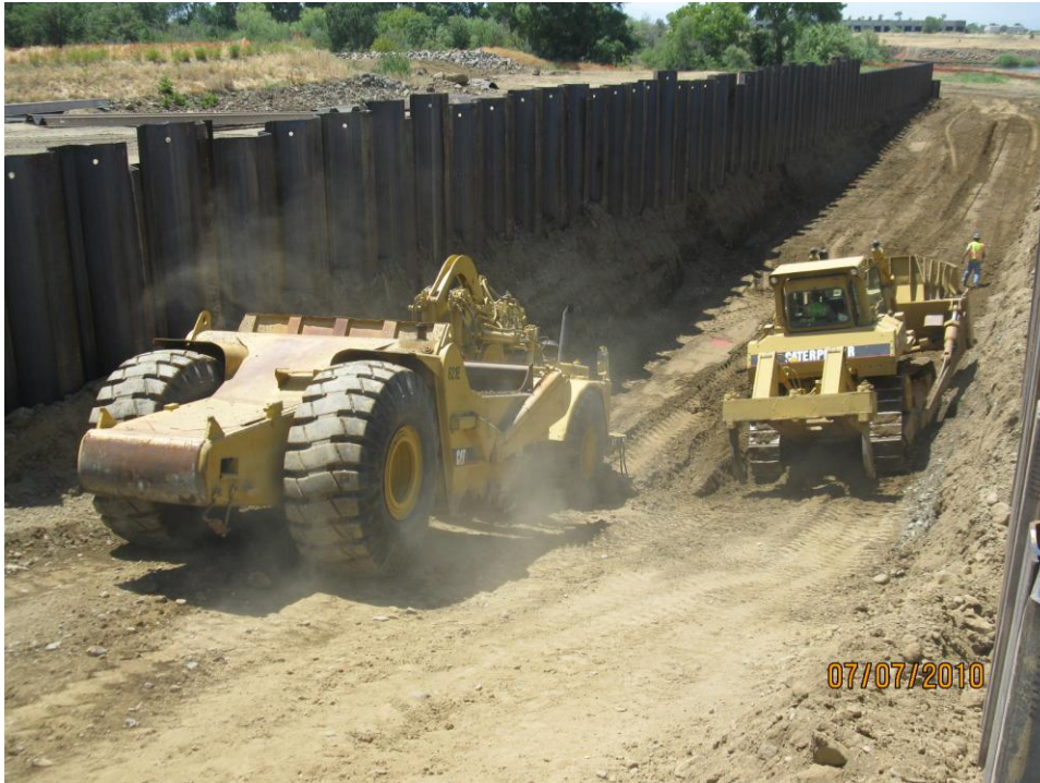
More excavating out the canal on the east side of Red Bank Creek.