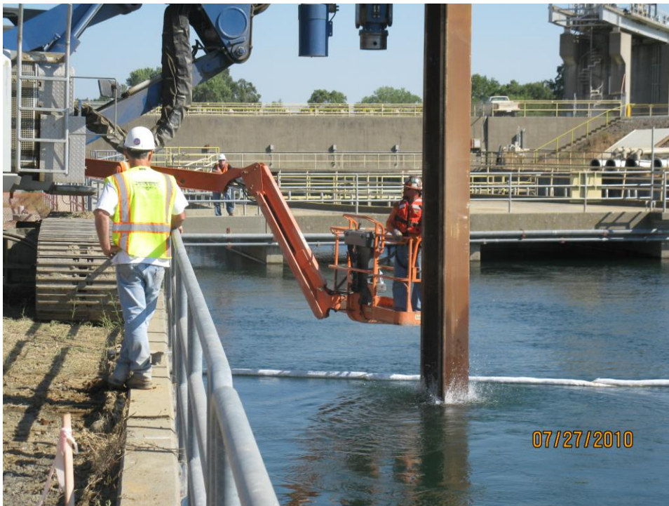
Driving sheet pile inside the settling basin.