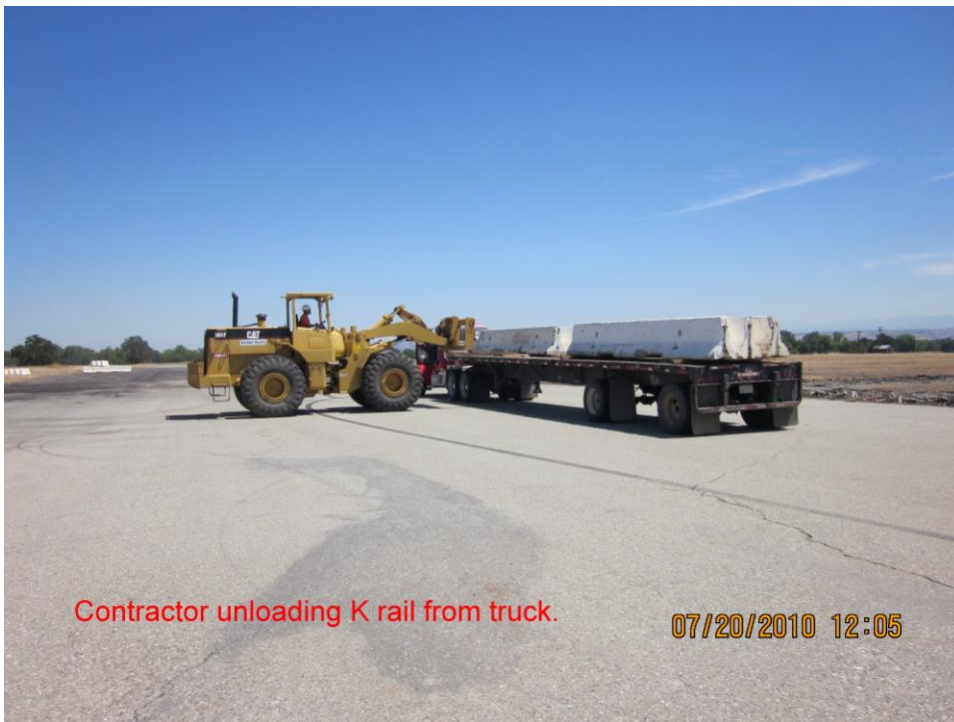
Balfour Beatty mobilizing onsite.