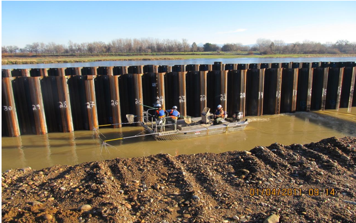
Fish Bio performs a fish rescue operation between the cofferdam and the shoreline of the Sacramento River.