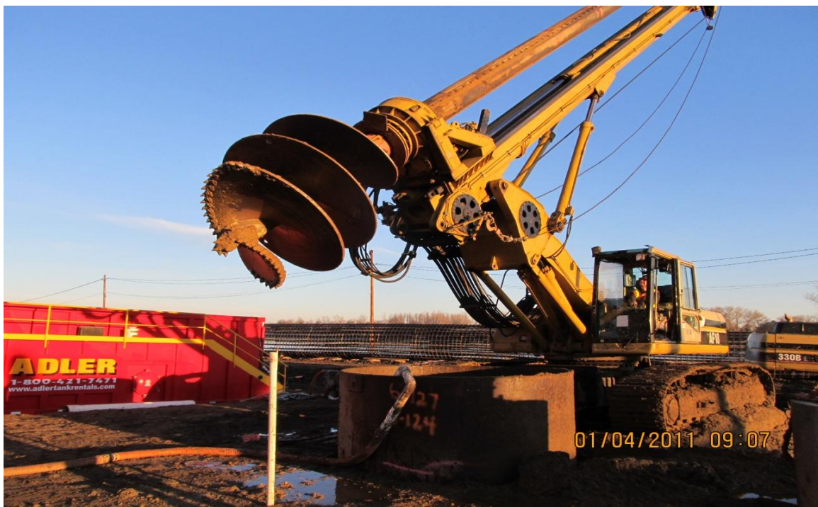
Balfour Beatty subcontractor Pacific Coast Drilling preparing to auger Pier #6