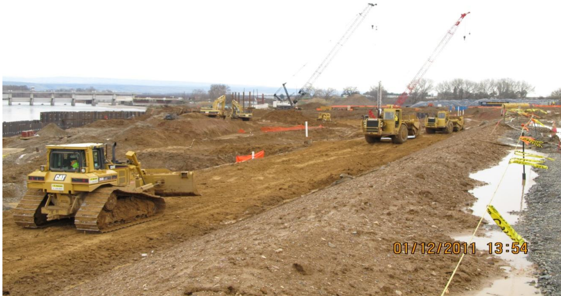
Balfour Beatty Subcontractor Meyers excavating in the forebay.