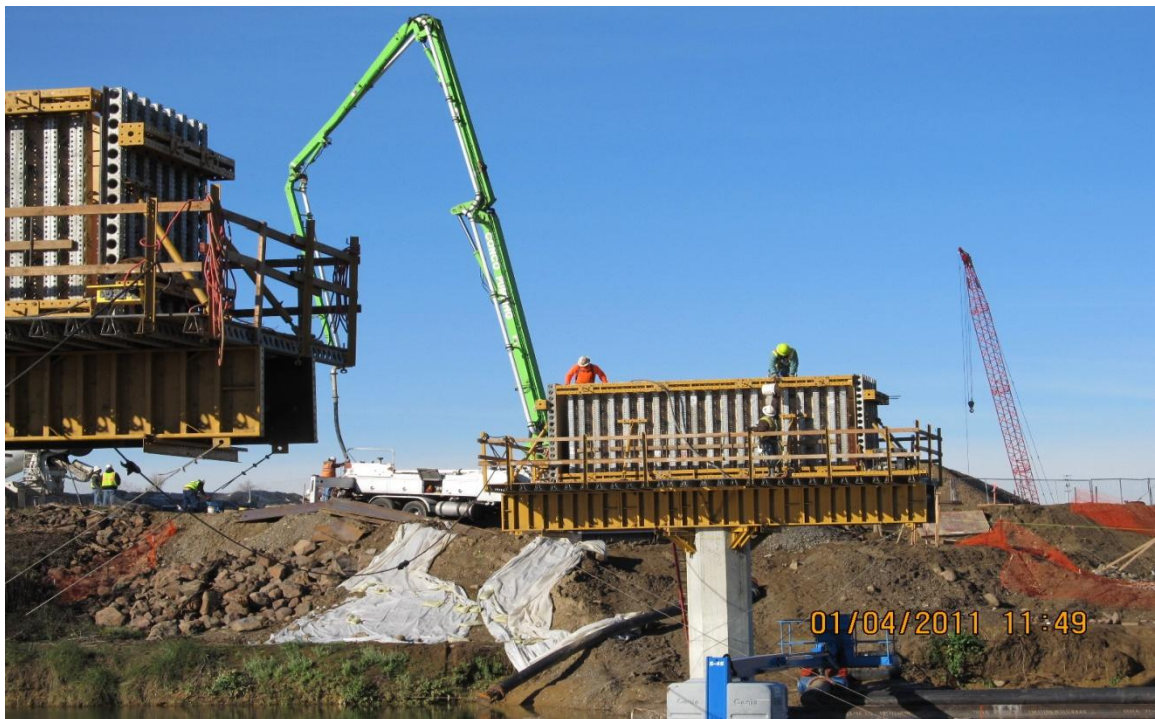
West Bay Builders pumping concrete into bridge support column caps #2 and #3