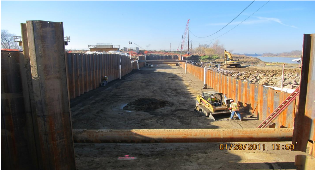
West Bay Builders Subcontractor Meyer's Earthwork begins to place processed backfill in the Siphon Barrel Structure.