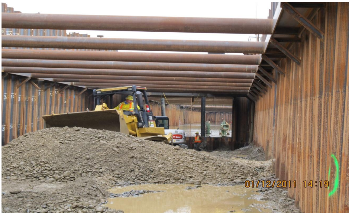
Balfour Beatty's loader excavating within the fish screen cofferdam.