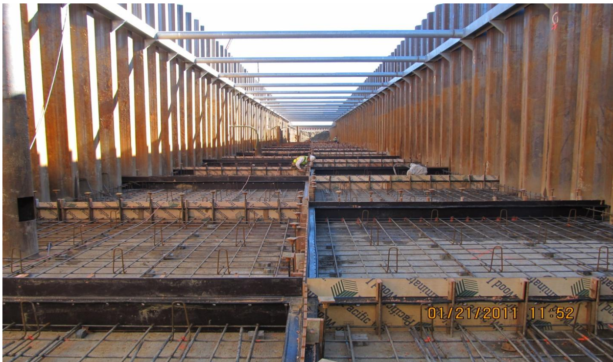
West Bay Builders installing edge forms & water stop for structural slab in the downstream canal.