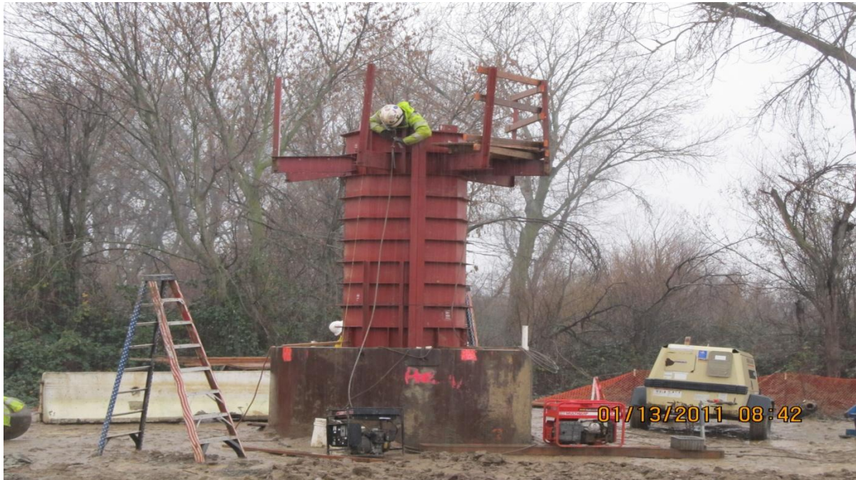
West Bay Builders preparing Column #6 for concrete placement.