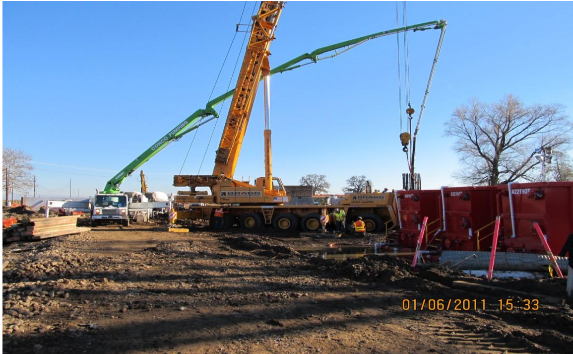
West Bay Builders placing concrete into the drilled shaft for Pier #6.