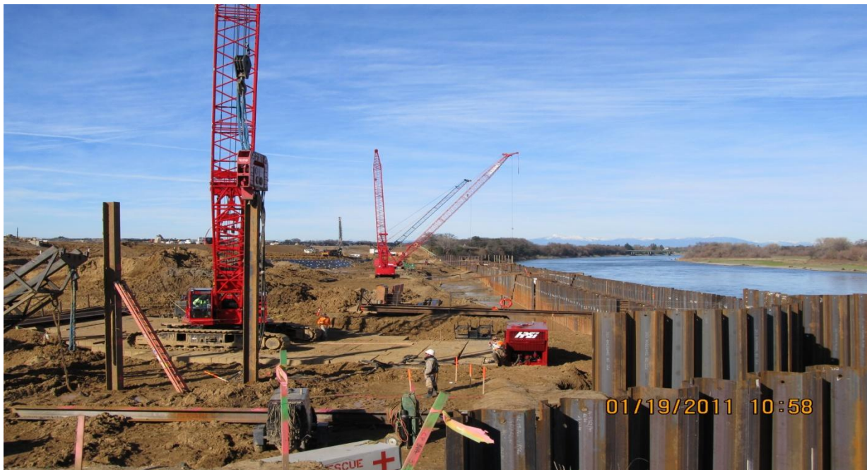
Balfour Beatty's crane drives pin (H) piles for east access inside sheet pile wall.