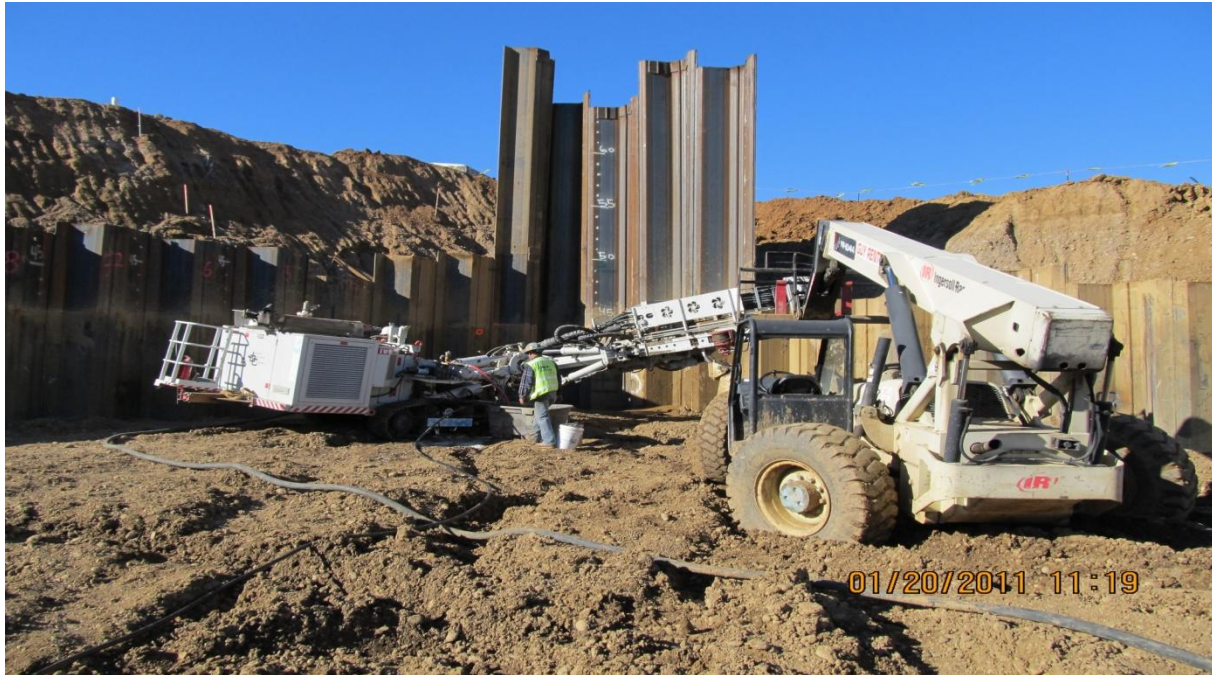
Balfour Beatty's Subcontractor Jensen Drilling, drills holes for tie backs on pumping plant sheet piles.