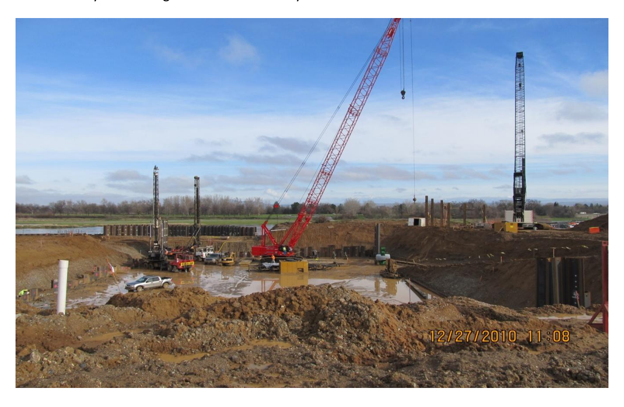
Balfour Beatty's Subcontractor Jensen Drilling Drilling Relief Holes Along the Pumping Plant Forebay Sheet Pile Wall