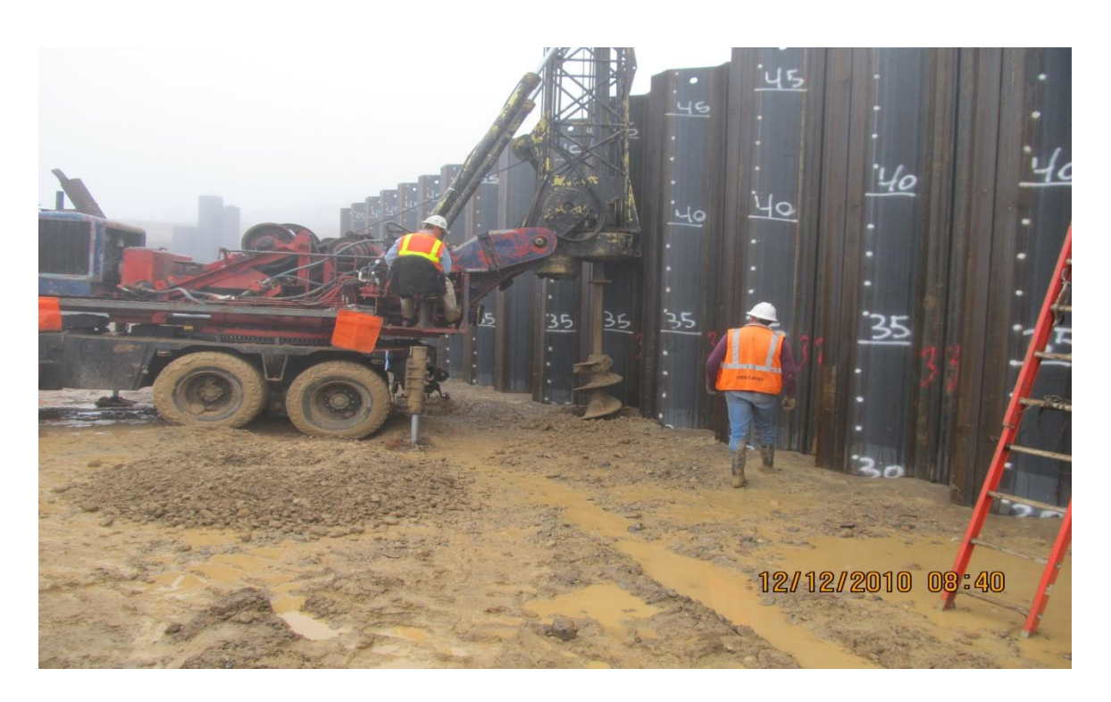
Balfour Beatty Subcontractor Jensen Drilling, Drilling Inside Pumping Plant Sheet Pile Wall to Help Reduce Driving Pressure