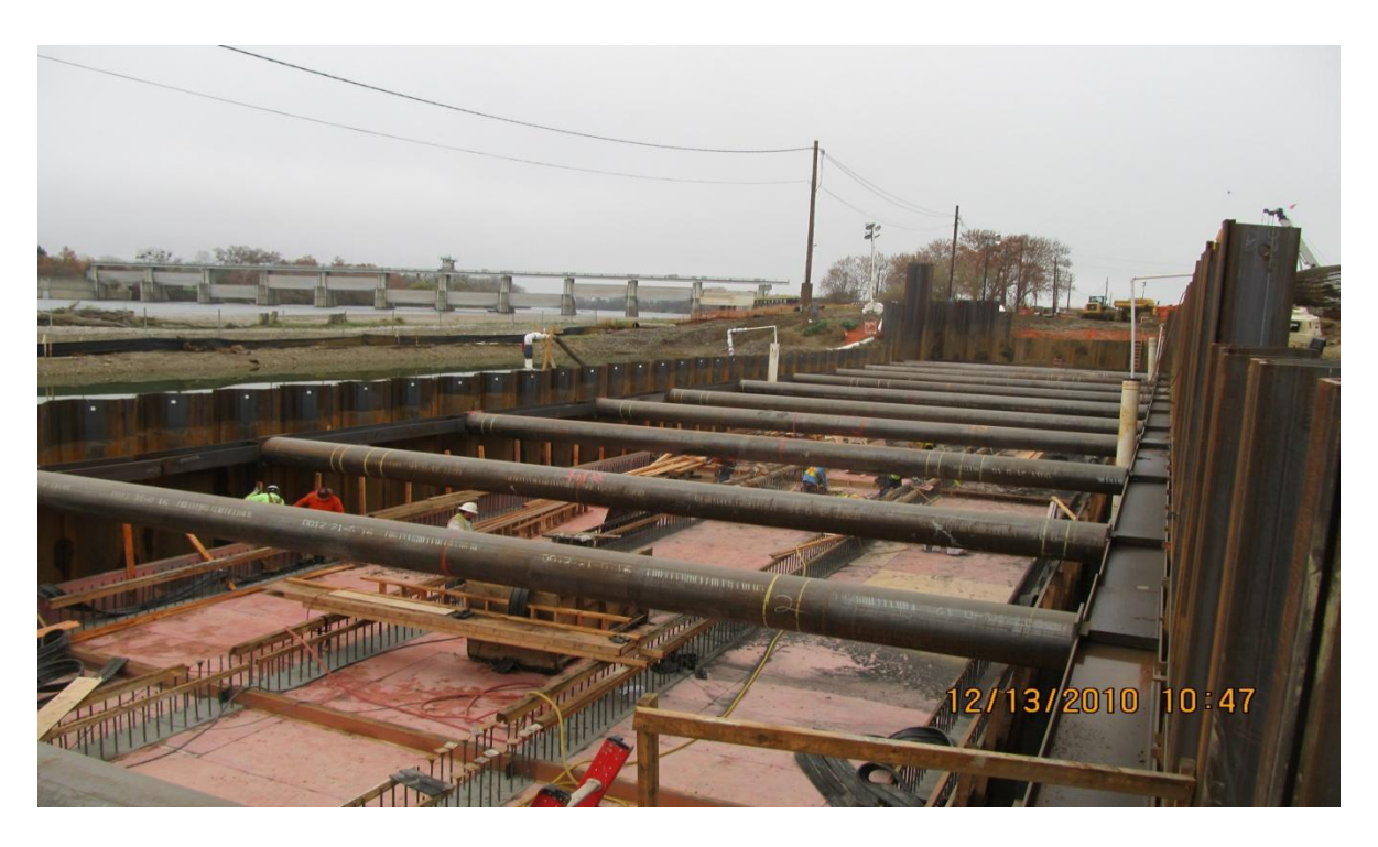
West Bay Builder's Siphon Barrel Structure Phase 1 Deck Forming