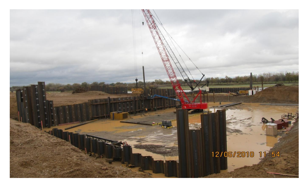
Balfour Beatty Driving of Upstream Face of Pumping Plant Sheet Pile Wall