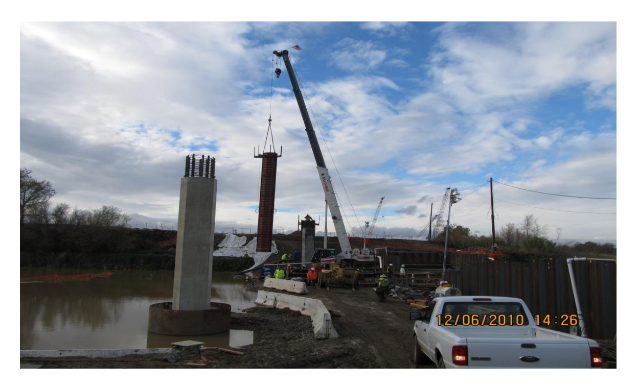
West Bay Builder's 50 TN Link Belt Crane Stripping the Forms Off Bridge Column