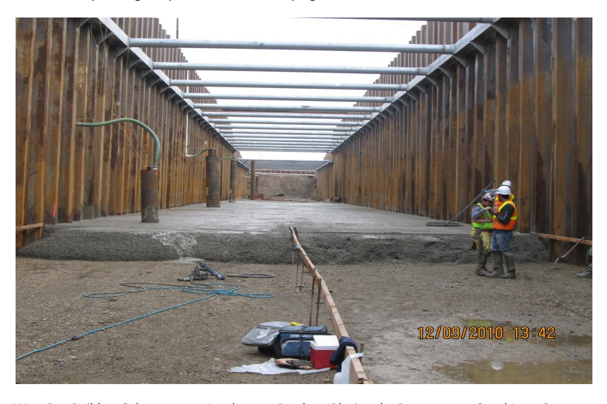
West Bay Builders Subcontractor Landavasso Brothers Placing the Downstream Canal Lean Concrete Slab on Grade