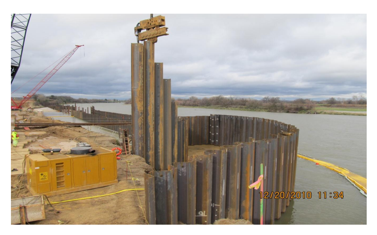
Balfour Beatty Pile Driving Downstream Forebay and Fish Screen Sheet Pile Wall