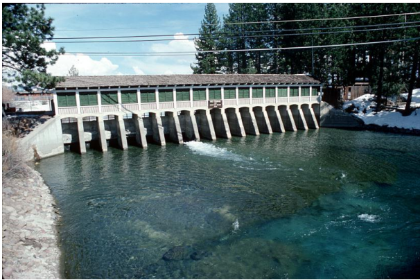
Lake Tahoe Dam and Reservoir.

Lake Tahoe Dam, a small dam at the outlet of Lake Tahoe, the source of the Truckee River, controls releases into the river. Downstream, the Derby Diversion Dam diverts the water into the Truckee Canal and carries it to the Carson River. Other features include Lahontan Dam and Reservoir, Carson River Diversion Dam, and Old Lahontan Power Plant. The Truckee-Carson project (renamed the Newlands Project) was authorized by the Secretary of the Interior on March 14, 1903. Principal features include: