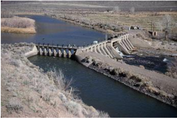
Derby Diversion Dam diverts water into the Truckee Canal.

The Carson River Diversion Dam is on the Carson River five miles below Lahontan Dam. The dam diverts water into two main canals to irrigate Carson Division lands. The diversion dam has a concrete control section and has a diversion capacity of 1,950 cfs. It was completed in 1906.